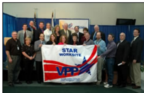
Members of the NIOSH Morgantown Safety Committee and Safety Office, along with distinguished participants at the ceremony.