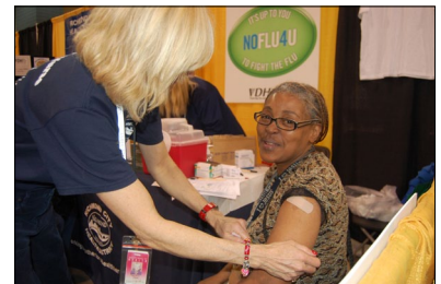
CBS affiliate WTVR and Virginia Commonwealth University Medical Center sponsor flu vaccine clinic in Richmond.