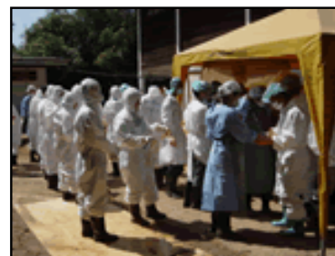
Workers doffing PPE immediately after leaving the victims identification (temporary morgue) area at Wat Yan Yao morgue site.