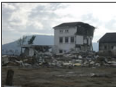
The destructive force of the earthquake and tsunami flood waters.

The earthquakes and tsunamis that struck Southeast Asia on December 26, 2004 caused one of the worst natural disasters in modern history. Over 250,000 deaths are directly attributable to the events, approximately 500,000 people were injured and five million people are homeless or without adequate access to sustainable resources. The devastation was enormous and the ongoing massive cleanup, recovery and rebuilding efforts are remarkable. Ensuring that those involved with this arduous task remain safe and healthy is the foundation for NIOSH response efforts undertaken as part of CDC's recovery assistance.