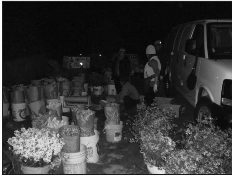
Figure 2. Preparing buckets of flowers night before taking to farmers' market.