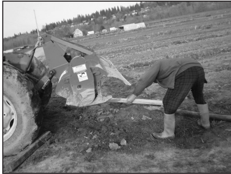
Figure 3. Farmer removing mud from tractor tiller attachment.