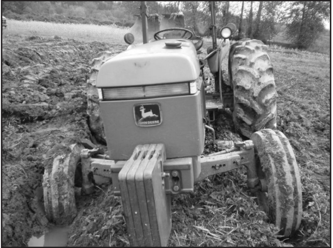
Figure 4. Tractor lodged in mud.