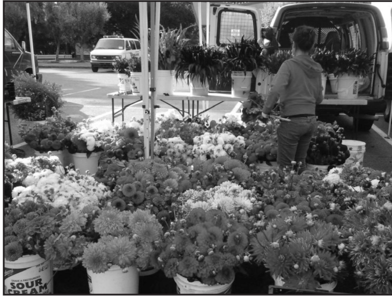
Figure 5. Flowers at farmers' market.