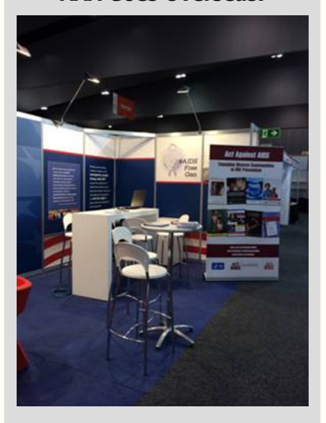
Act Against AIDS travels to Melbourne, Australia, for the 2014 International AIDS Conference

adults. Attendees who got tested at sites around New York City were rewarded with tickets to an exclusive VIP concert experience. In addition, through Lifebeat, an HIV testing-focused, AAA-branded PSA aired in New York City's Times Square from June 20–27.