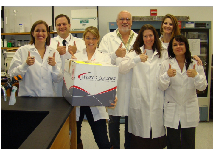
Photo: Isolates of Neisseria meningitidis and DNA specimens collected in Burkina Faso were shipped to the CDC Meningitis Laboratory in November. DBD Lab staff give a proud "thumbs up" as they prepare to start a series of lab tests as part of CDC's ongoing technical support for meningitis research and surveillance activities in sub Saharan Africa.

meningitis and completes enrollment of 25,000 subjects for the meningococcal carriage study in Burkina Faso.