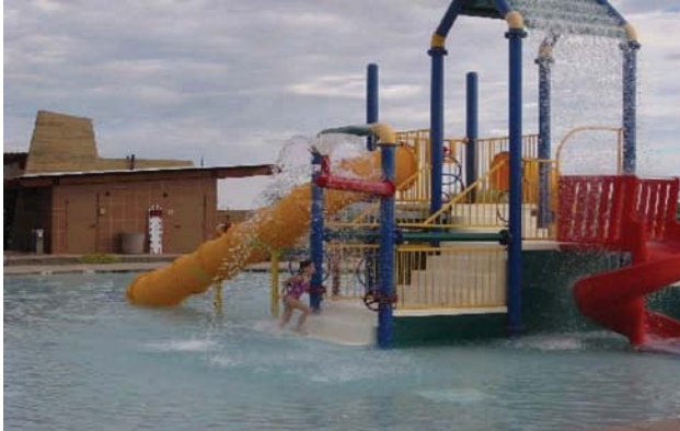
Figure 3 A water feature at a waterpark

Editor's note: Additional information about cryptosporidiosis outbreak prevention and response is available in the Cryptosporidiosis Outbreak & Response Evaluation (CORE) Guidelines at: http://www.cdc.gov/crypto/resources/core_guidelines.pdf