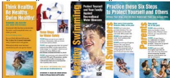
Figure 1 Image of the Healthy Swimming brochure

Recreational Water Illness (RWI) Prevention week is fast approaching and will be the topic for the next Water, Hygiene and Sanitation (WASH) webinar on March 17, 2010 (see page 2). This year's theme is "Pool Inspections." Please contact HealthySwimming@cdc.gov with any questions. The Healthy Swimming brochure (shown below) and pool chemical safety poster are available for free online in English and Spanish at: http://wwwn.cdc.gov/pubs/swim.aspx