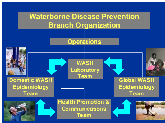
Figure 2 The organization of the Waterborne Disease Prevention Branch

Data and lessons learned from WDPB activities will serve as a foundation for developing prevention and control recommendations in the context of strong partnerships. The WDPB will continue to work closely with state, territorial, local, and global partners and will strive to enhance WASH support and resources available to these partners. The WDPB will also collaborate with internal and external federal partners, such as CDC's Legionella Team, the National Center for Environmental Health's (NCEH) water-related environmental health programs, and Environmental Protection Agency (EPA).