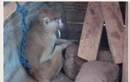
During Herpes B outbreak investigation, Ghana FELTP residents found pet monkeys being kept in the home.