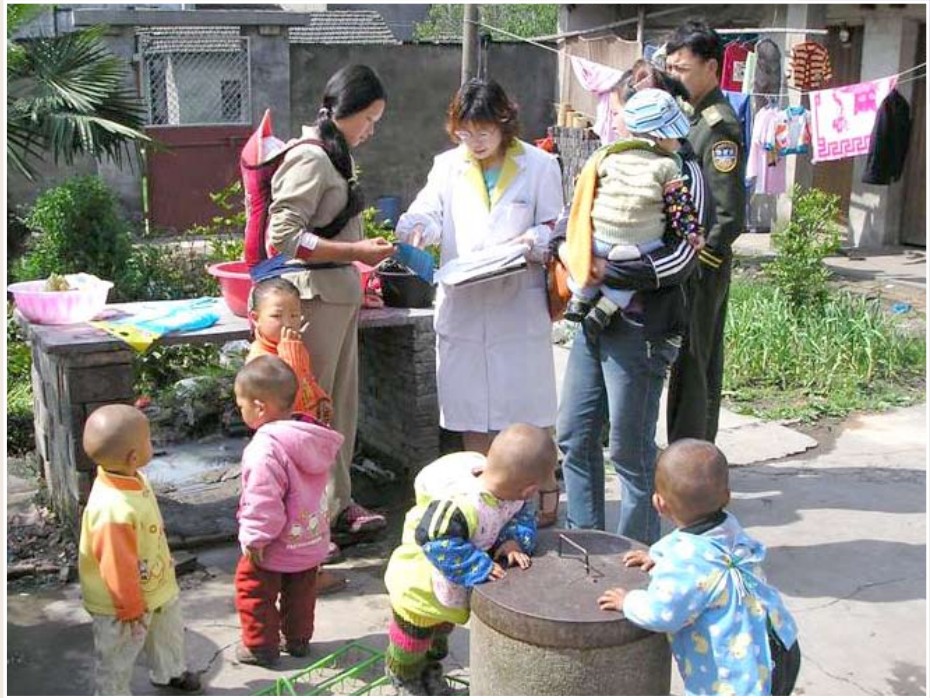
A doctor visits the homes of migrant workers to collect information about their children's vaccination status.

In March 2011, the findings of the investigation were published in the Chinese FETP Dispatch and distributed to leaders at the Ministry of Health and China CDC. After seeing this report, the Ministry of Health and the China CDC's EPI Center organized a symposium, inviting the CFETP officer and her supervisor to give a presentation on the outbreak and the result of their analysis. China CDC and China FETP helped develop a case-study for training staff at the national, provincial, and local CDCs in China. The national MOH leaders also decided to conduct