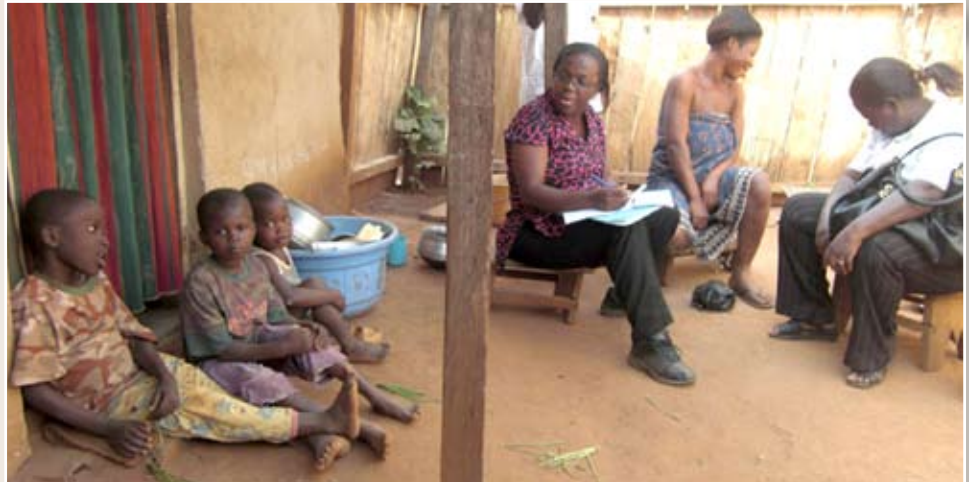
During Herpes B outbreak investigation, Ghana FELTP residents interview family and observe surviving children.

In January 2011, 8 patients presenting with encephalitis and loss of consciousness and 3 deaths were reported by the Techiman Municipal Director of Health to the Brong Ahafo Regional Director of Health in Ghana, who then asked the