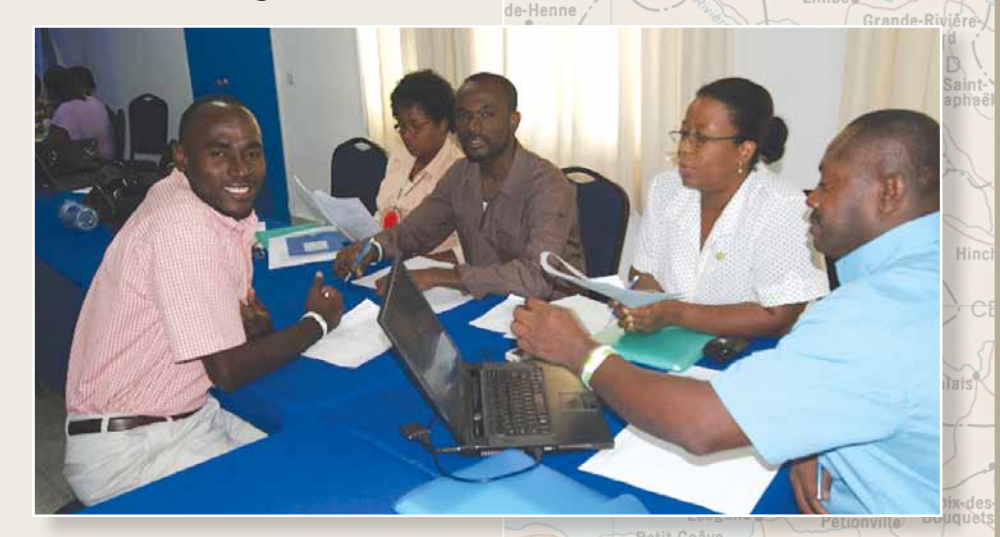
HAITi-FELTP residents working in small groups on a case study.

A little over a year after the devastating earthquake, CDC began screening candidates for the Haitian FETP which is modeled after the pyramid structure of the Central America FETP and based on the CDC's Epidemic Intelligence Service program. The Central America program