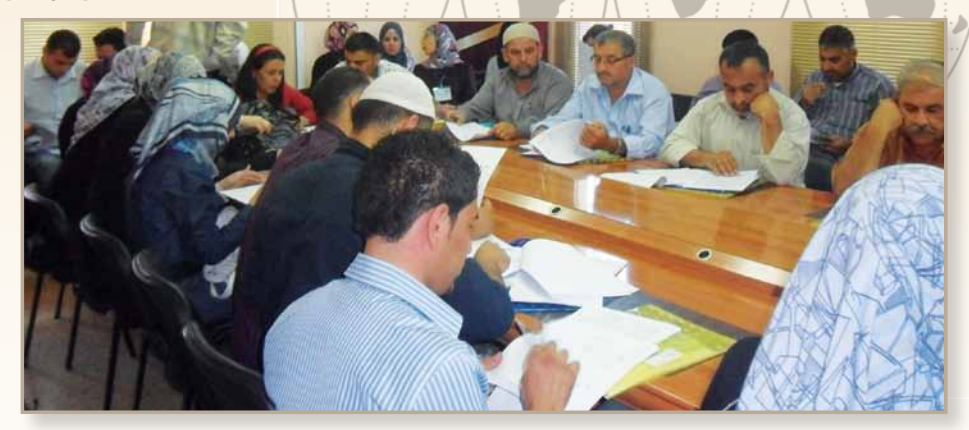
FETP residents and Ajloun governorate staff discuss implementation of the physical activity project.

The Field Epidemiology Training Program (FETP) has been in existence for over 30 years and is widely recognized for its success in working with ministries of health to build epidemiology capacity in lowand middle-income countries. Although originally designed to help countries respond to infectious disease threats, FETPs have been increasingly part of the effort to address NCDs. In FY 2010, CDC's Division of Public Health Systems and Workforce Development (DPHSWD) and the National