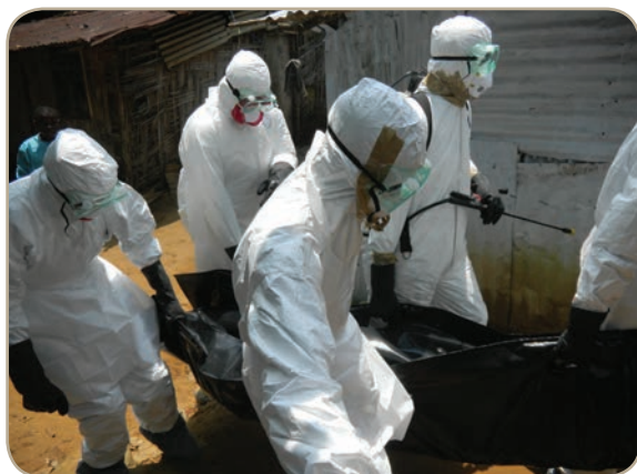
Burial team for those who have died from Ebola. Location: Monrovia, Liberia.

As the Ebola outbreak continues, CDC and the many courageous front line health workers in West Africa work endlessly restore health and wellbeing to those impacted.