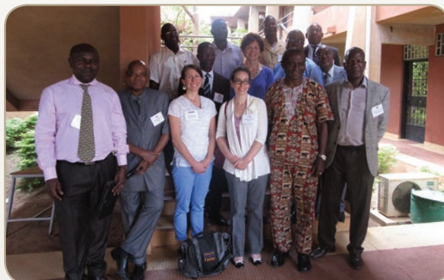
WAFETP workshop participants. University of Ouagadougou, Ouagadougou, Burkina Faso, September 24, 2014.