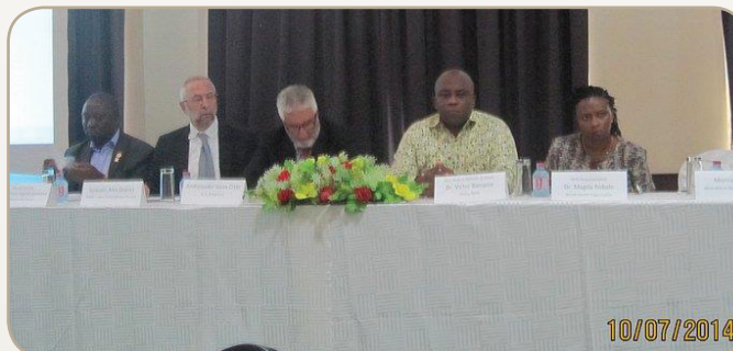
Dignitaries open the Preparedness workshop in Accra Ghana, October 7, 2014.