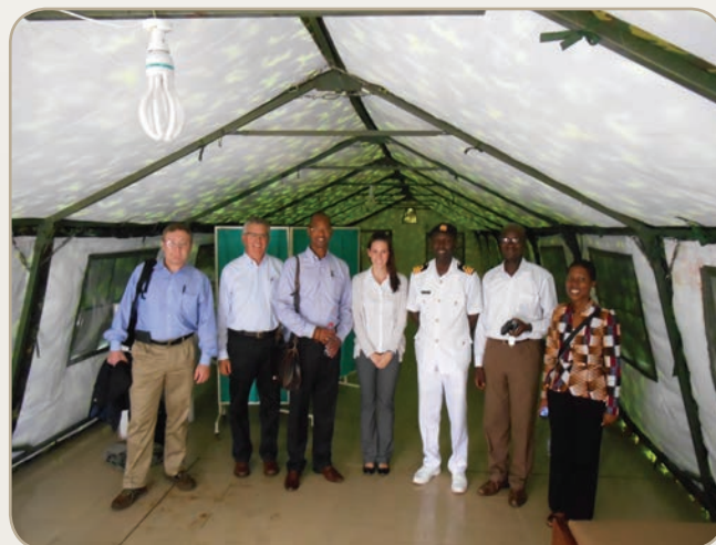
Members of CDC's International Task force at an Ebola Treatment Unit that is being established to prepare for possible Ebola cases in Ghana. Accra, Ghana. September 2014.