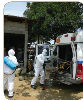
Local ambulance used to transport suspect Ebola cases. Location: Monrovia, Liberia.