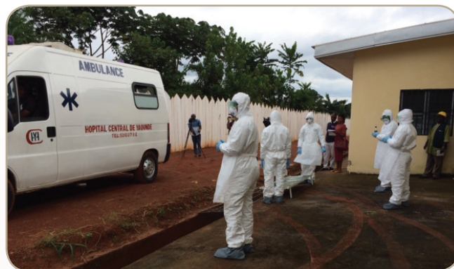
During an EVD preparedness simulation exercise in Yaounde, Cameroon, ETU staff waits for a confirmed case patient. This exercise was conducted as part of a WHO Preparedness Support Team visit, November, 2014.