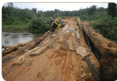
Bridge in Sinoe County, Liberia depicting the types of roads that must be crossed to reach villages.

For more information, contact: Julia Smith-Easley at zrc2@cdc.gov .