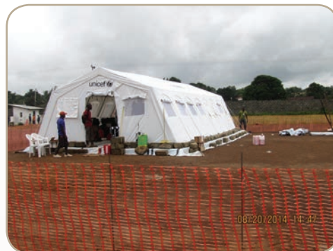
The initial mobile lab set up by the CDC-NIH team in Monrovia, Liberia to support the Ebola outbreak response, taken August 20, 2014.