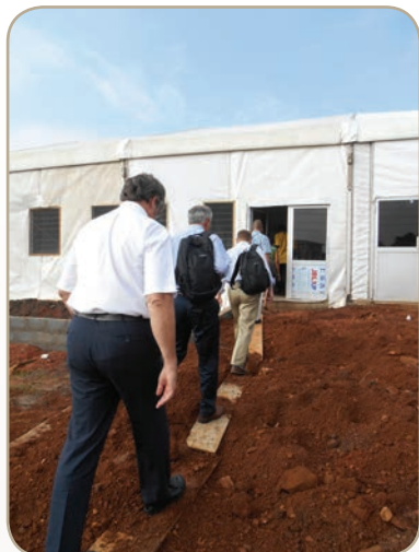
Members of the CDC International Task force walking into a construction site for a future Ebola Treatment Unit to assess the building's current status. Accra, Ghana. September 2014.

Contact tracing has been used in each of the previous 20 Ebola outbreaks for the past 40 years to successfully control Ebola and is being implemented in this outbreak as well. Success stories from Nigeria and Senegal demonstrate how contact tracing can be effective in the current outbreak. Recognizing the importance of contact tracing, the Unaffected Countries Team has created contact tracing guidelines, curricula, and training materials to assist each at-risk country in preparing for an outbreak of disease. CDC staff deployed to priority unaffected countries are providing these resources to ministries of health and other partners.