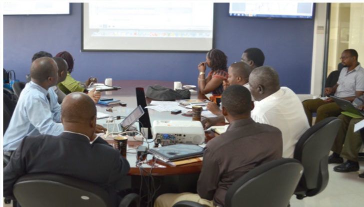
Members of the Uganda MoH Incident Management Team meet in the new Emergency Operations Center during a Meningitis outbreak.

Multiple training activities and modalities have been employed across these three countries. In addition to dedicated training on