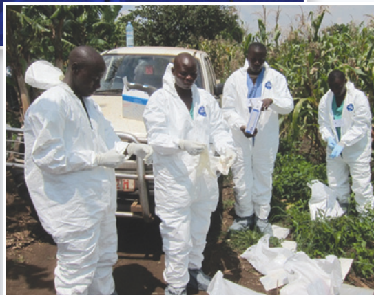
In September 2012, Uganda epidemiologists collect virus samples from the field, to test for deadly Ebola virus.

CDC conducted a similar demonstration project in Vietnam. Working together with the MoH, CDC provided technical assistance for emergency operations, information systems and laboratory training to strengthen existing capacity. A culturally tailored emergency operations handbook containing internationally-recognized functions and procedures for response management, as well as an EOC, was created. An electronic communicable disease surveillance system, Epi Info TM 7.0, was also incorporated into the training to