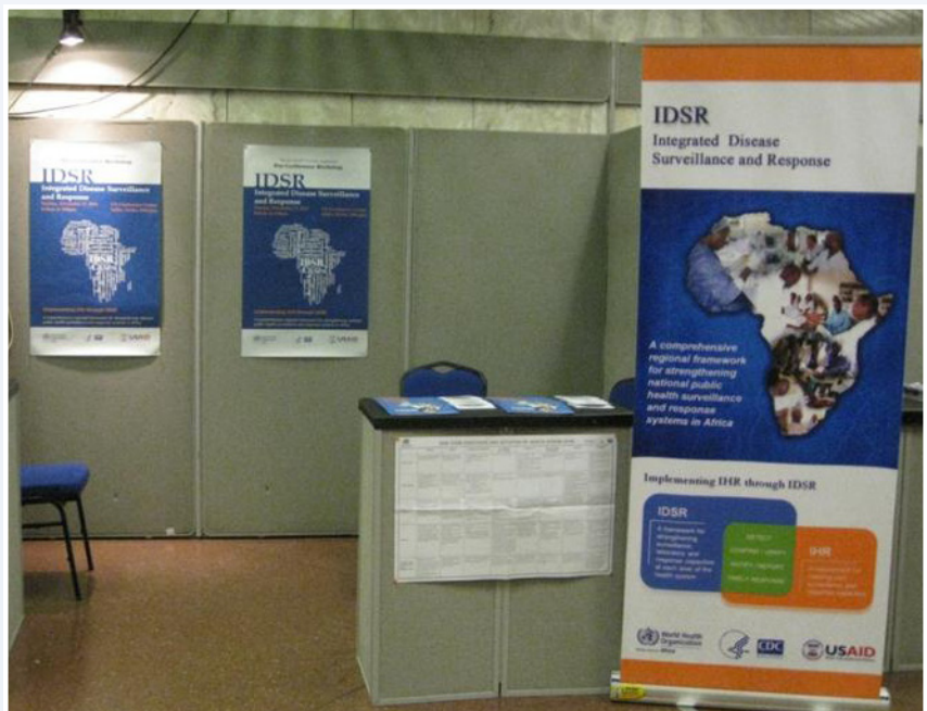
AFENET IDSR Booth at the UNCC exhibition area.