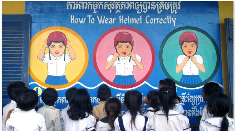
Cambodian students participating in the Helmets for Kids program observe a mural illustrating proper helmet use.

In Uganda, many motorcycles operate as taxis, locally known as “boda bodas.” GHVI efforts focus on these high-risk motorcycle users. Helmet observations at taxi stands where motorcycle riders participated in GHVI road safety workshops and received helmets