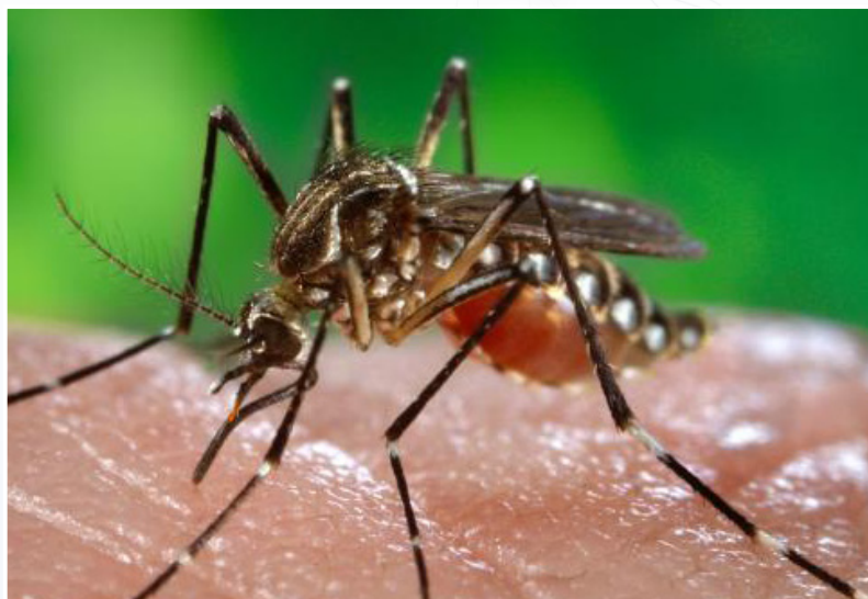
Photo of Aedes aegypti mosquito feeding on a human.

Upon the finding of the first autochthonous chikungunya cases in the Americas, DVBD, in coordination with PAHO, has shared