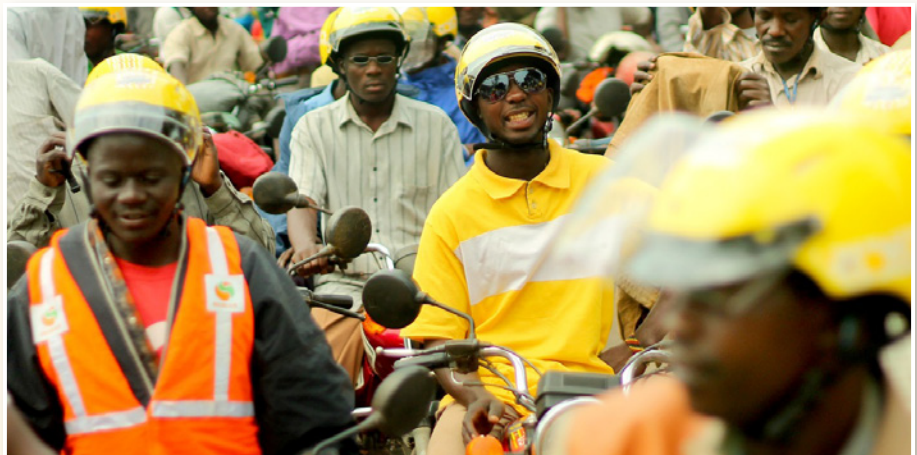
Motorcycle taxi operators (“boda boda”) leave a Global Helmet Vaccine Initiative (GHVI) workshop wearing their newly issued helmets.

showed an increase in helmet use by motorcycle riders from 31% to 57%, on average, in 2012.