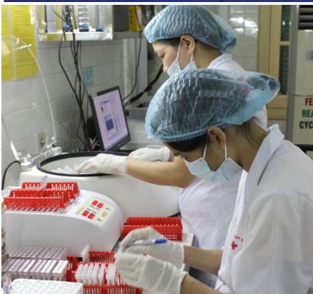
Lab workers in Vietnam run diagnostic tests.

Dr. Tom Frieden, Director of the Centers for Disease Control and Prevention (left), Secretary Kathleen Sebelius, Department of Health and Human Services (center), and Rand Beers, Under Secretary of Homeland Security (right), represent the U.S. government at the launch of the Global Health Security Agenda on February 13, 2014. Twenty-six countries joined the US, committing to accelerate progress toward a world safe and secure from the threat of infectious disease: Argentina, Australia, Canada, Chile, China, Ethiopia, Finland, France, Georgia, Germany, India, Indonesia, Italy, Japan, Kazakhstan, Mexico, Netherlands, Norway, Republic of Korea, Russian Federation, Saudi Arabia, South Africa, Turkey, Uganda, United Kingdom, and Vietnam.