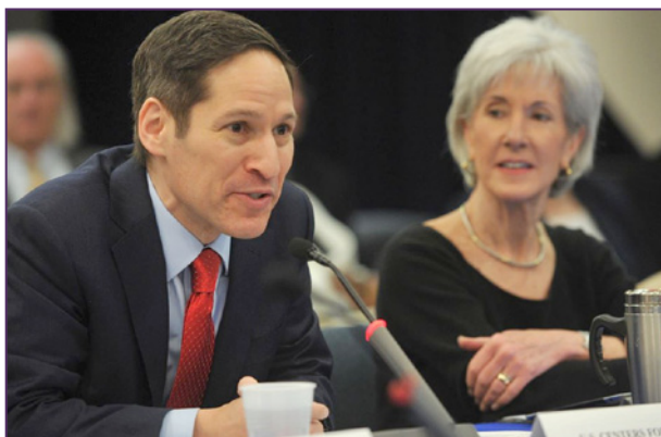
Secretary Kathleen Sebelius, Department of Health and Human Services (right) looks on as Dr. Tom Frieden, Director of the U.S. Centers for Disease Control and Prevention opens a meeting on February 13, 2014, of 27 countries and 3 international organizations (WHO, OIE, and FAO) to launch the Global Health Security Agenda (GHS). Over the next five years the United States plans to work with at least 30 partner countries (totaling at least 4 billion people) to prevent, detect and effectively respond to infectious disease threats, whether naturally occurring or caused by accidental or intentional releases of dangerous pathogens.

In support of the GHS, the U.S. Department of Defense (DOD), Defense Threat Reduction Agency, and CDC have devoted $40 million to fund Global Health Security (GHS) activities in up to 10 countries in fiscal year 2014. CDC’s Division of Global Health Protection