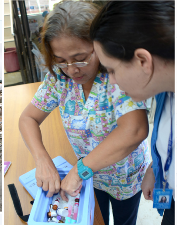
A WHO member is overseeing the vaccinations that a nurse from the Tacloban City Health Office will be administering later that day. In preparation for the measles vaccine campaign, she has measles, vitamin A and oral polio ampoules in the portable vaccine cooler.

In November 2013, Typhoon Haiyan struck the eastern side of the Philippine Islands, home to 11 million people. The storm, with sustained winds of 195 mph and gusts up to 240 mph, is the strongest typhoon to strike landfall in recorded history. Typhoon Haiyan also created a 20 foot tall, tsunami-like storm surge, which further decimated the coastal communities. More than 6,000 people lost their lives and an estimated 4 million people were displaced from their homes by the storm.