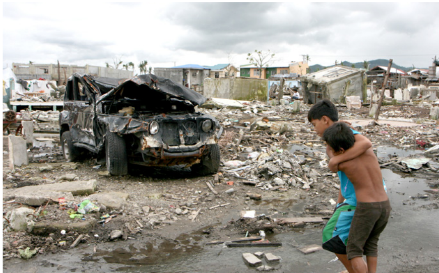
In Tacloban the damage from Typhoon Haiyan was devastating.