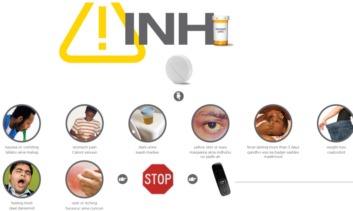
Figure 1: INH tear sheet in English and Somali

If you take Isoniazid (INH) and have any of these side effects, stop taking INH and call your doctor or public health nurse. Hadaad qaadatid daawada tiibshada (INH) oo aad isku aragtid mid ka mid ah calaamadahan, jooji daawada oo wac dhakhtarkaga ama kalkaalisada caafimaadka bulshada (neerasta).