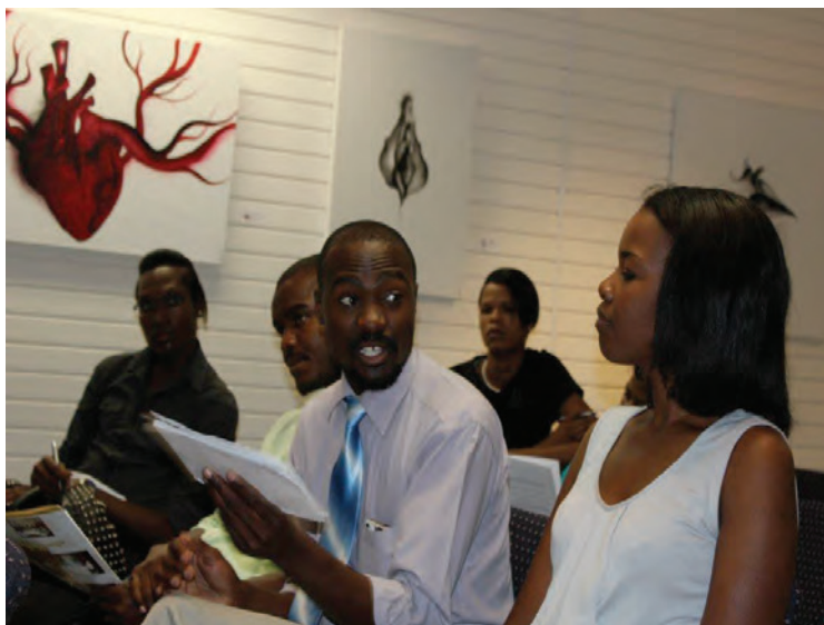
Above: Forum participants expressing their views

based violence was critical as agents to drive the process of women empowerment.