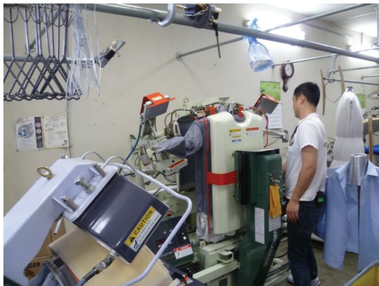
Figure 1. Employee pressing shirts by using two pressing machines in series.

In the shops that we evaluated, the drycleaning machines had enclosed drums where the fabrics being cleaned were saturated with the drycleaning chemical. In all the alternative solvent drycleaning machines we observed in this evaluation, any cleaning additives (e.g., detergent, stain repellent) were injected into the solvent flow line or into the drum of the drycleaning machine (in contrast to an older method that involved predissolving the detergent in the solvent). When the cleaning cycle was complete, the solvent was drained, and the cleaned fabrics were placed under vacuum, heated, and tumbled to remove any remaining solvent. Employees could manually spot-clean fabrics that were still stained or soiled after drycleaning, using the same products used in precleaning. The cleaned fabrics were pressed (Figure 1) and ironed as needed, then hung on hangers and covered with plastic wrapping awaiting customer pick-up.