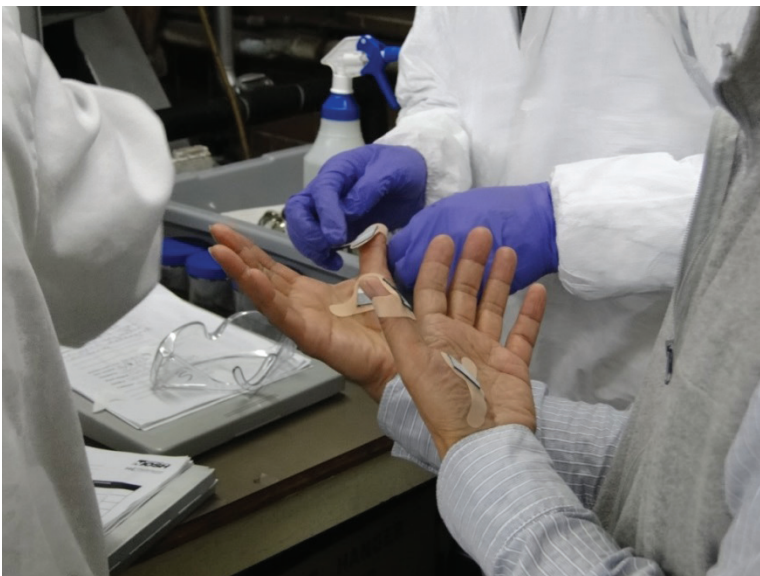
Figure 3. Patch samplers being placed on the owner/operator's hands before he donned protective gloves.

We used patches (PERMEA-TEC™ Sensors for solvents) to determine whether butylal or DF-2000 contacted the hands of employees and owner/operators when they used protective gloves. While wearing nitrile gloves to avoid contamination, we placed four patches on the skin, beneath the protective gloves that were worn during a task (Figure 3). A patch was placed on the palm and one finger of each hand. The patch sample analysis methods for butylal and DF-2000 are described in Appendix D.