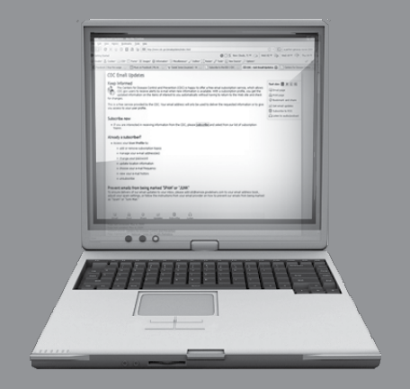
Table of contents Podcasts Ahead of Print CME Specialized topics

Sign up to receive emailed announcements when new podcasts or articles on topics you select are posted on our website.