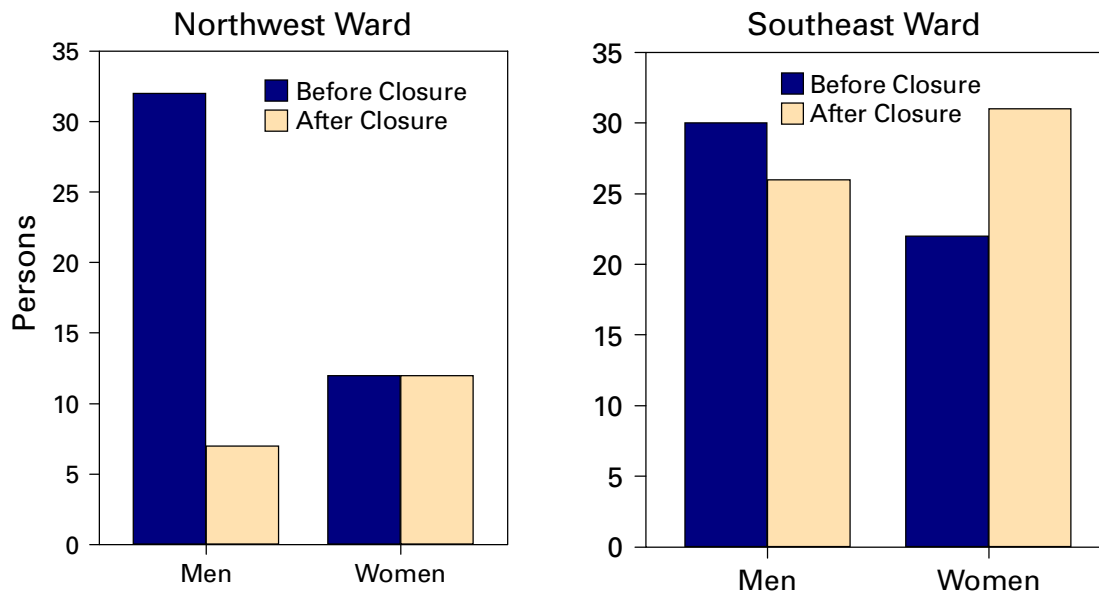
FIGURE 1. Number of persons with reported primary and secondary syphilis, by sex and ward of residence before and after closure of the northwest sexually transmitted disease clinic — Washington, D.C., May 1994–April 1996*

*The 12 months before and the 12 months after closure of the northwest clinic.