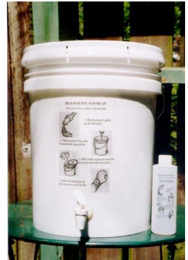
Program Components: Safe Storage and Solution Bottle

Users add one capful of Dlo Pwòp to 5 gallons of water stored in a local container modified with a tap and lid, which is provided at subsidized cost to program participants by the JSWF project. One bottle provides enough solution for one family for one month. The Haitian project administrator keeps track of income, expenses, and supplies. Three Haitian technicians produce the hypochlorite solution, offer trainings to bring new families into the program, conduct household visits to provide ongoing training and chlorine residual testing, sell the hypochlorite solution, and maintain records. All program staff are fully paid from program income. An independent evaluation of the pilot project in January 2003 documented a reduction in diarrheal disease incidence of 55% among users. Based on these successful results, the project began expanding throughout neighboring communities, and now has over 2,500 families enrolled.