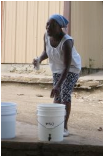
Training Families in SWS Use

An estimated 1.1 billion persons lack access to an improved water source. Hundreds of millions more drink contaminated water from improved sources because of unsafe water treatment and distribution systems and unsafe water storage and handling practices. The health consequences of inadequate water and sanitation services include an estimated 4 billion cases of diarrhea and 1.9 million deaths each year, mostly among young children in developing countries. The Safe Water System (SWS) is a water quality intervention proven to reduce diarrheal disease incidence in users by 22-84%. The SWS includes water treatment with chlorine solution at the point-of-use, storage of water in a safe container, and behavior change communication.