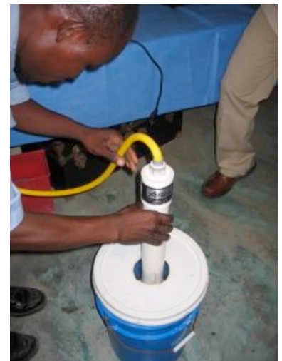
Using the Generator to Make Solution