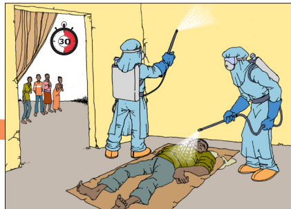
Allow health workers to handle the body and clean the home.