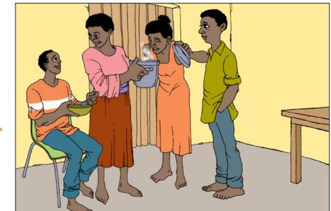
Once your home is clean it is safe to return