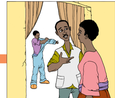
Allow health workers into your home.