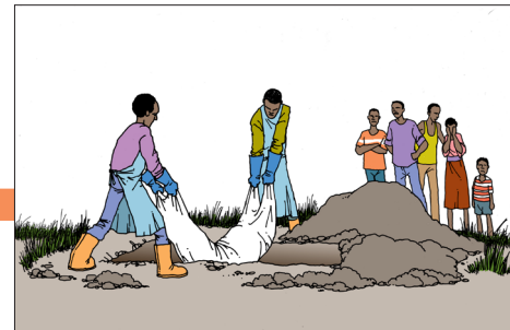
Avoid sharing food, drink and communal washing of hands during funeral rites. Delay funeral feasts till later in the year.