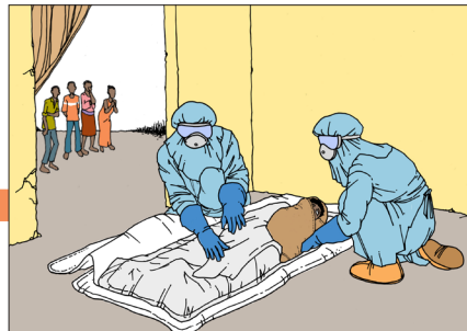
Go with the health workers to the funeral site. Those who die from Ebola must be buried promptly.