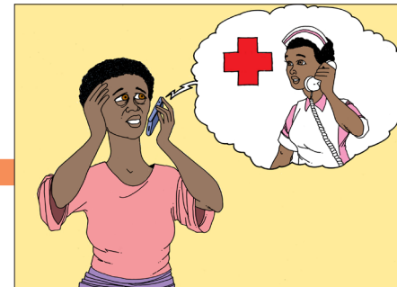
Call a health worker.