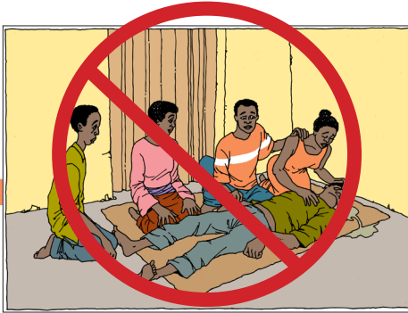
Do NOT touch the body, bedding or body fluids.