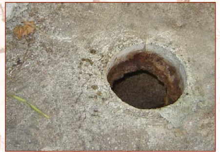
Open septic tank