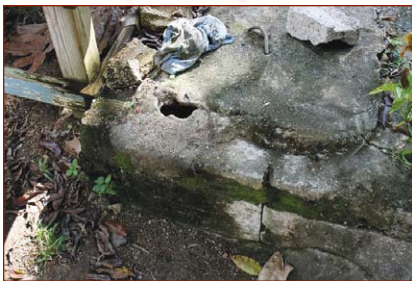
Broken septic tank cover