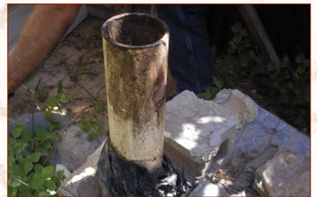
Uncovered vent pipe