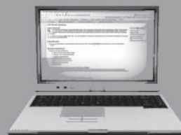
Table of contents Podcasts Ahead of Print Medscape CME Specialized topics