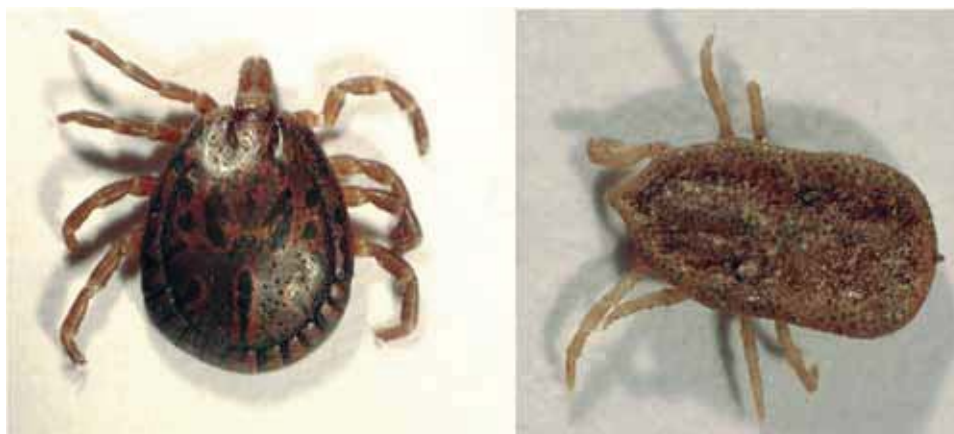
Figure 2. Amblyomma loculosum (left) and Carios capensis (right) ticks from seabird colonies on western Indian Ocean islands.

Partial sequencing was performed on the Rickettsia spp. gltA gene from 60 ticks, including ticks from each island and both species. Phylogenetic analyses revealed 7 haplotypes clustering in 4 well-supported clades; some of the haplotypes corresponded to previously described species (Figure 3). No association was found between Rickettsia spp. and collection location (island), but strong host (tick) specificity was observed (Figure 3). All A. loculosum ticks were infected with a Rickettsia strain showing 100% nt identity with the R. africae strain infecting A. loculosum ticks in New Caledonia and with the ESF-5 strain isolated from the cattle tick, A. variegatum , in Ethiopia (GenBank accession no. CP001612.1). Rickettsia spp. in C. capensis ticks had 3 well-supported genetic clusters and, thus, were more diverse. The most frequent Rickettsia sp. in these ticks (64% of the sequences) was a probable strain of R. hoogstraalii . Other haplotypes corresponded to an unknown Rickettsia sp. that was closely related to R. hoogstraalii and to a probable strain of R. bellii (28% and 8% of the sequences, respectively). The haplotype of R. bellii was detected only on Réunion Island in 2 C. capensis ticks collected within the same nest of the wedge-tailed shearwater ( Puffinus pacificus ).