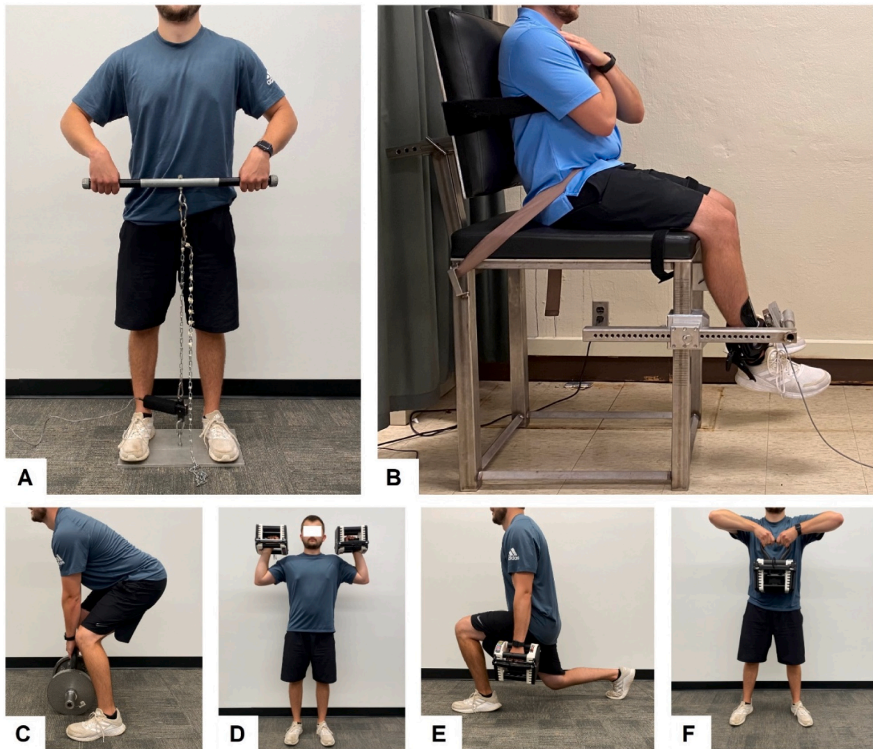
Fig. 1. Examples of (A) the upper-body isometric upright row and (B) the lower-body isometric leg extension strength assessments as well as the four resistance training exercises including the (C) deadlift, (D) shoulder press, (E) lunges, and (F) upright row.

flat metal platform (on which the participants stood on) and an adjustable chain which connected to a metal bar. Participants grasped the bar with a pronated grip, hands in line with their shoulders, shoulders abducted, and elbows flexed. The chain was adjusted to one chain link below the level of the umbilicus and this chain length was kept consistent for each participant. Following three submaximal warm-up contractions (50%–75% of perceived maximum effort), participants performed three isometric maximal voluntary contractions (MVCs) with a two-minute recovery period in between each muscle contraction. Participants were initially instructed to pull the bar sub-maximally to remove the slack in the chain immediately prior to the start of the MVC, as determined with visual feedback of force production. Once the baseline force was completely steady, participants were given strong verbal encouragement to pull as hard and as fast as possible during each contraction for 3–4 s. If the participant utilized a countermovement or did not explosively produce force during the MVC (visual inspection of the force-time curve), an additional MVC was performed. An additional UB MVC was performed at PRE ( n = 10 ), P24 ( n = 6 ), P48 ( n = 1 ), and P72 ( n = 4 ).