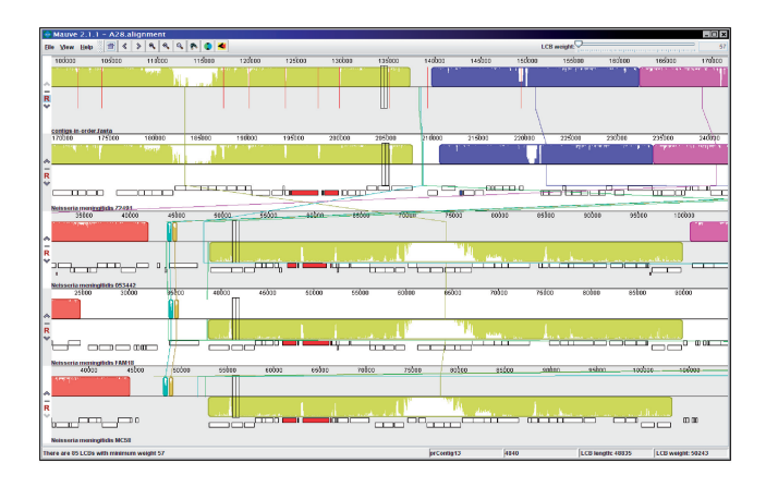
Fig. 2. Comparative analysis of draft assembly with MAUVE. The top pane represents the active assembly; vertical lines indicate contig boundaries (gaps). The reference genomes are arranged in subsequent panes in order of phylogenetic distance. Blocks of synteny (LCBs) are displayed in different colors (an inversion of a large block is visible between panes 1–2 and 3–5). Most gaps within LCBs were joined in the manually assisted assembly, while considering factors such as sequence conservation on contig flanks and presence of protein-coding regions.

simple assembler for short genomes, was used to combine the constituent assemblies.