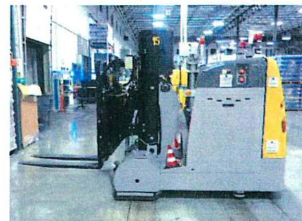
Photo of LGV involved in the incident.