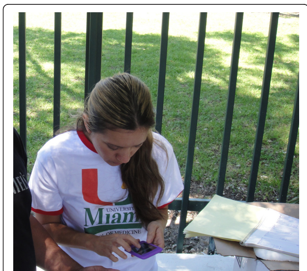
Figure 2 Student interviewer using touch screen handheld device to record construction worker responses adjacent to lunch truck.

Some disadvantages should be noted. Senior study interviewers were reluctant to embrace use of the handheld device, citing difficulties with seeing the screens outside in bright light and in pressing the screen question options. In addition, while the devices have very long battery life (~30 hours) between charges, quality checks for battery life were necessary to ensure workability and function in the field. Although the initial start up cost may appear high for each device (~$200), data entry costs were eliminated, making use of handheld devices particularly attractive for researchers conducting multiple, ongoing field assessments. Finally, the relative ease of use combined with the low long-term cost (e.g. monthly subscription fee of $20/month to