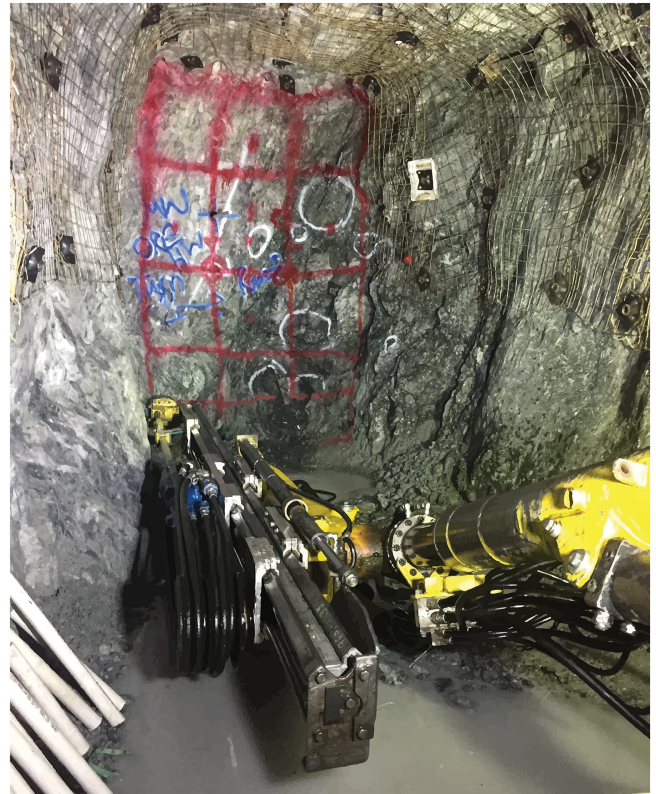
Fig. S2—Field evaluation setup at a mining face in the studied underground metal mine.

Six iPhone 6/6S devices were mounted with iPhone holders on a multi-mount horizontal bar supported with a tripod. The height of the tripod was adjusted to 1.2 meters, which is the approximate height of a person holding a sound measurement instrument. Two types of external microphones, the MicW i436 and Dayton Audio iMM6, were chosen based on previous studies 14,15 . Both microphones are omni-directional; however, only MicW i436 complies with the International Electrotechnical Commission's (IEC) standard for a Class 2 SLM standard according