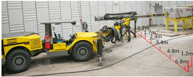
Fig. S1—Laboratory experiment setup in the NIOSH hemi-anechoic chamber.

In the above NIOSH study, an average accuracy of \pm 2 dBA from a reference professional instrument was achieved when measuring pink noise from 65 to 95 dB in 5-dB increments in a reverberation chamber, using internal microphones manufactured by Apple. Using external calibrated microphones improved the agreement to an accuracy level of \pm 1 dBA 10 .