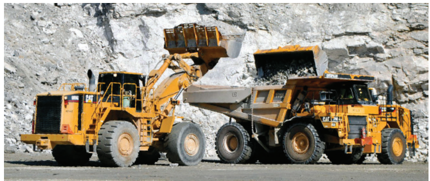
Haul trucks and front-end wheel loaders show the highest number of injuries related to jarring/jolting and whole-body vibration.

The primary characteristics of whole-body vibration are vibration frequency,