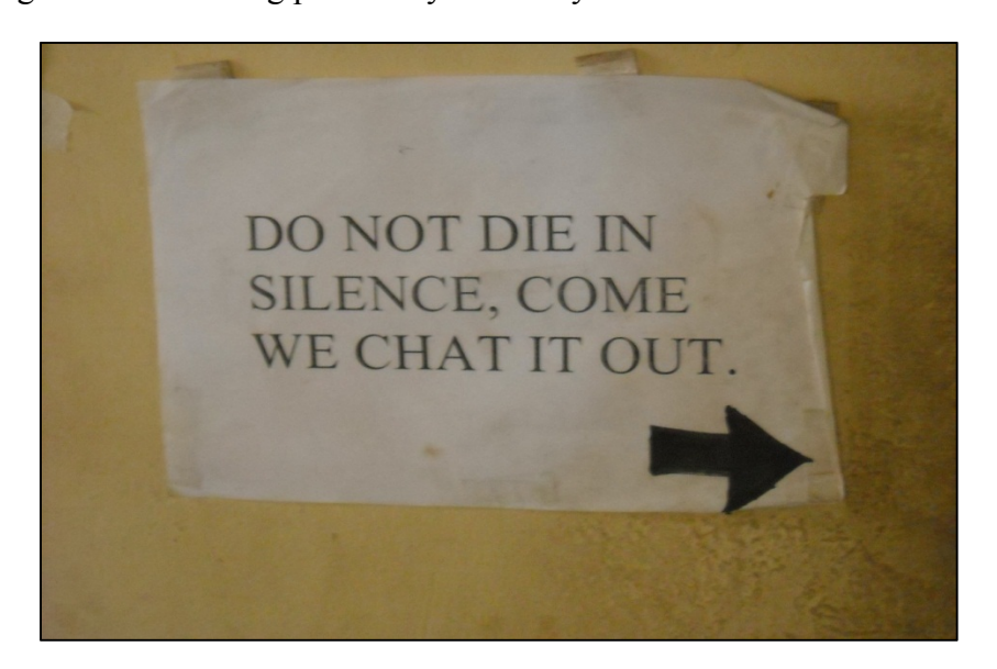
Figure 2. Note posted on wall in Drop-in Center, by UYDEL staff, to encourage help-seeking behaviors among potentially suicidal youth.

Despite these limitations, the findings clearly underscore grave and unmet needs among these vulnerable youth which has implications for research and practice. While these vulnerable youth may have unique circumstances and needs, overall the psychosocial correlates associated with suicide ideation examined in this study mirror those of previous studies of other African youth [8,10,12,39]. However, additional research is needed to replicate these findings since they are primarily based on a convenience sample of youth who have sought out services offered by a drop-in center. As such, their experiences may be different than that of other youth and should be documented in greater detail and also preferably in a longitudinal cohort to better determine the initiation of risk behaviors and the identification of modifiable factors that may be suitable for prevention.