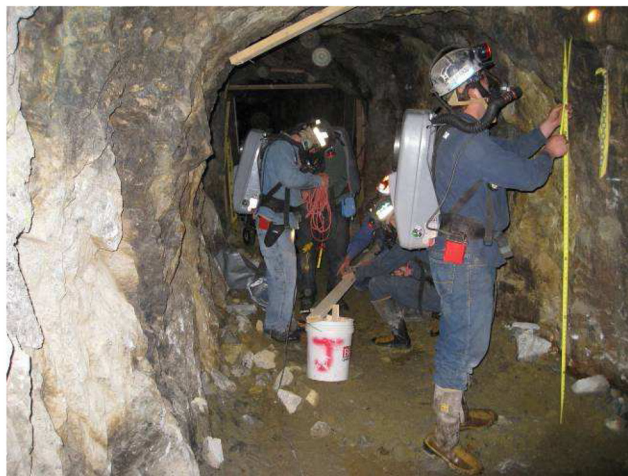
Figure 8 — Edgar Mine MERD exercise showing teams building a ventilation control.

Sumiton Campus, was established to meet the immediate needs of Alabama coal companies for mine workers and to create a pipeline of future skilled workers. It offers short-term academic certificate programs and other training, including a new underground miner, refresher, mine electrician, first aid/CPR and mine rescue. This facility is available for public use.