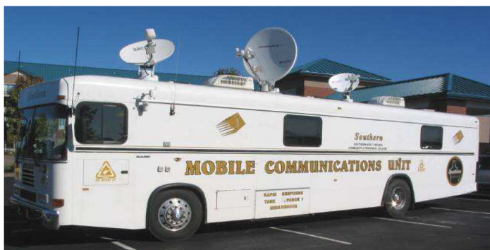
Figure 7 — SWVCTC Mobile Communications Unit (Command 1) equipped with a multiple-satellite communication system.