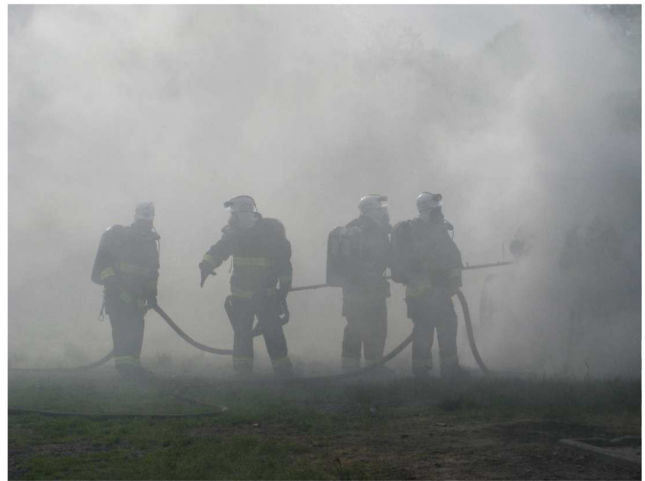
Figure 6 — Mine rescue team fighting a fire at the MSHA MSL fire gallery.

8. RLC Coal Mining Training Center, Rend Lake Community College, Ina, IL ( http://www.rlc.edu/ ). Rend Lake Community College, in partnership with the state of Illinois and the federal government, has been awarded funding to design, engineer, equip and construct a coal-mining training facility to revitalize its mining technology program. This program will