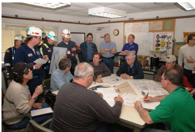
Figure 4 — MERD incident command center exercise at the NIOSH Bruceton Coal Mine.

themselves and to take action. WVU believes that every miner, fire brigadesman and mine rescue team member should have, at a minimum, first responder training.