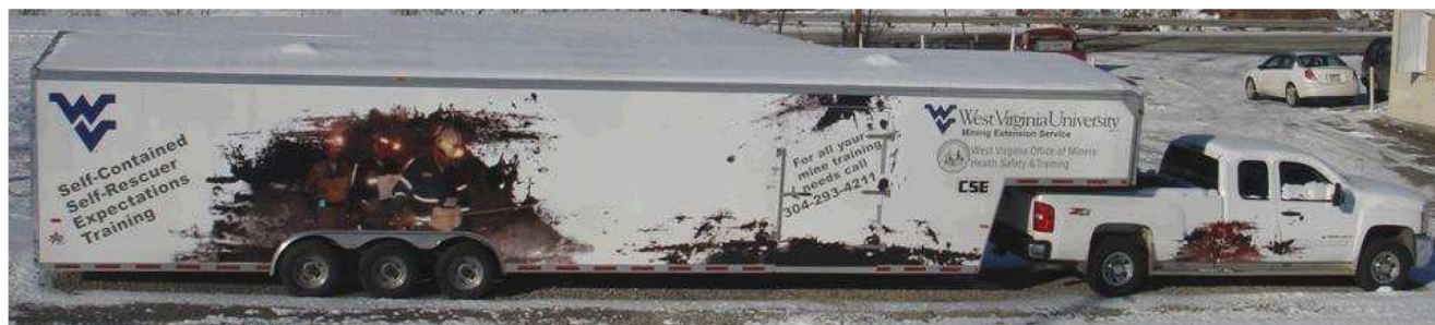
Figure 5 — WVU Mining E&O’s mobile unit (The Truck) for first responder training in a smoke maze.

The lower floor of the building, shown in Fig. 6, simulates a typical room-and-pillar coal mine, with four entries and nine crosscuts (Dept of Labor, MSHA, Mine Simulation Lab 2008). The burn area, on one end of the building, includes an incombustible burn tunnel and concrete pads. Mine rescue training includes problem solving and first aid classroom courses, numerous outdoor firefighting drills, exploration and navigation in poor visibility and other exercises where team members conduct hands-on mine rescue tasks, including the construction of temporary and permanent ventilation controls while under apparatus. Other noteworthy features of this complex are dormitory space for 320 people, classrooms and laboratories that can accommodate 600 students, a cafeteria,