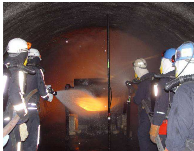
Figure 3 — NIOSH LLL outdoor fire gallery (simulated belt entry) showing two teams extinguishing a fire.

The SRCM is a conventional room-and-pillar operation approximately the size of a large working section of a coal mine and is utilized for mine health and safety research in areas such as ground control, ventilation, fires, emergency response, materials handling, communications, remote sensing and drilling and environmental monitoring. This research mine also has a reversible fan, water hydrants, electric power and compressed air. Although it is not publicly available for regular use, the real-life environment makes it an attractive place to conduct mine rescue and fire brigade training research, including a variety of smoke-training exercises and mine emergency response development (MERD) drills. The MERD incident command center, shown in Fig. 4, is located next to the mine and includes communications and mine rescue team staging areas.