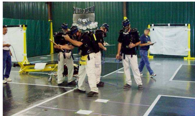
Figure 2 — The indoor mine rescue contest practice field at Consol Energy's Buchanan Mine training facility.

3. NIOSH Bruceton Coal Mine, Pittsburgh Research Lab; Bruceton, PA ( http://www.cdc.gov/niosh/mining/ ). There are actually two adjacent mines at this location, the Safety Research Coal Mine (SRCM) and Experimental Mine, which are used to support health and safety research for mine workers. The Experimental Coal Mine, currently not available to the public, consists of two drift entries and multiple rooms with concrete floors driven into the Pittsburgh coal seam. It was created to support full-scale mine ventilation, fire and explosion tests. There are two areas specially designed to handle large fires without risk of the coal seam catching on fire.