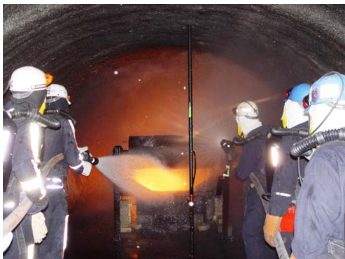
Figure 3. NIOSH LLL outdoor fire gallery simulated belt entry) showing two teams extinguishing a fire.