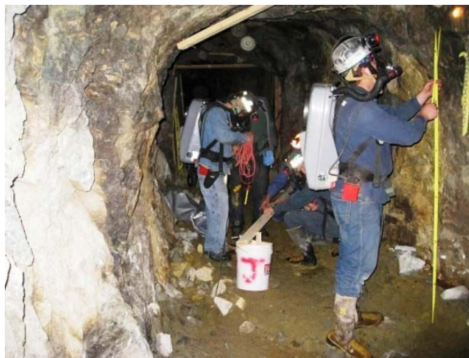
Figure 7. Edgar Mine MERD exercise showing teams building a ventilation control.

MERD exercises, using modified MSHA-approved rules, are offered that engage team members in realistic and hands-on training. In one example, participating teams rotate through three different situations: incident command center, underground mine rescue team, and back-up mine rescue team. Mine rescue teams work a realistic problem using both contest rules and procedures for a real-life emergency by navigating in smoke, building ventilation controls (figure 7), simulating fire fighting and hose management, performing first-aid procedures on real persons, solving problems and making decisions, utilizing back-up teams, and performing command-center duties. Incident command training gives team members a better understanding of the skills and knowledge needed for decision-making, the use of mine rescue team information, ventilation issues, and delays that take place during an underground mine rescue. Teams are also given a written test (one per team) to assess their skills and knowledge and then participate in a debriefing discussion at the end of the exercise.