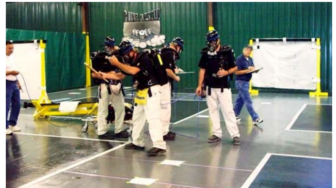
Figure 2. The indoor mine rescue contest practice field at Consol Energy's Buchanan Mine training facility.

Figure 2 shows the most unique feature in this facility – the indoor mine rescue twin practice fields that are each three entries wide and five entries deep and the coal blocks, painted on the floor, are 14 x 16 feet wide. This area is large enough to allow two teams to practice for contests simultaneously. Being able to utilize this field all year long and during bad weather creates an efficient training schedule.