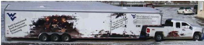
Figure 8. WVU Mining E&O's mobile unit (The Truck) for first responder training in a smoke maze.

Most of the first-responder training is conducted at mine sites for convenience to the mine operator. Two unique mobile training units are deployed to mines or remote locations. One specially-designed vehicle, named "The Truck" (figure 8), is equipped with a changeable 3-tiered smoke maze that is used to build confidence among miners while wearing SCSRs or SCBAs in confined-space drills. It consists of a series of movable partitions and swinging doors. The temperature and visibility can be adjusted to simulate the heat and smoke from a fire. Practical hands-on extinguisher and hose experience can be provided by the use of remotely-controlled fire pans in the mine yard.