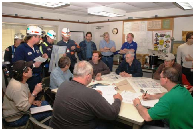
Figure 4. MERD incident command center exercise at the NIOSH Bruceton Coal Mine.

The SRCM is a conventional room-and-pillar operation approximately the size of a large working section of a coal mine and is utilized for mine health and safety research in areas such as ground control, ventilation, fires, emergency response, materials handling, communications, remote sensing and drilling, and environmental monitoring. This research mine also has a reversible fan, water hydrants, electric power, and compressed air. Although it is not publicly available for regular use, the real-life environment makes it an attractive place to conduct mine rescue and fire brigade training research including a variety of smoke-training exercises and mine emergency response development (MERD) drills. The MERD incident command center, shown in figure 4, is located next to the mine and includes communications and mine rescue team staging areas.