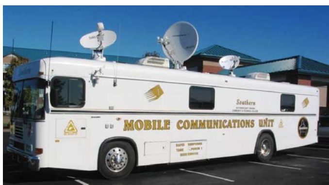
Figure 6. SWVCTC Mobile Communications Unit (Command 1) equipped with a multiple-satellite communication system.

SWVCTC places a heavy emphasis on incident command and mobilization of emergency assets and integrates this expertise into mine rescue training in the form of MERDs. This facility operates an on-call 24/7 fleet of five mine emergency response and support vehicles that is partly funded by the state of WV. Given the name Task Force 1, they are specially-designed to provide communications, rescue, and fire service to mines in very remote locations. Rescue equipment includes light towers, rescue jaws and cutters, 900-ton airlift bags, technical rope equipment for vertical rescue, self contained breathing apparatus (SCBA), portable power systems, and medical equipment. The Mobile Communications Unit (Command 1), shown in figure 6, is equipped with 12 computer workstations with fax/copy/scanner capabilities, a GPS and three satellite communication systems, MSHA-approved radio systems, a portable weather station, and helicopter landing-zone equipment. It can be used as an incident command center at any location that is accessible by a bus.