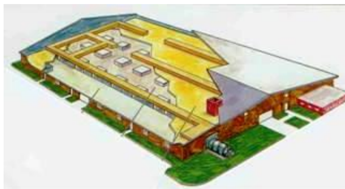
Figure 5. MSHA Mine Simulation Laboratory building cutaway.

The lower floor, shown in figure 5, simulates a typical room-and-pillar coal mine with four entries and nine crosscuts (4). The burn area includes an incombustible burn tunnel and concrete pads. Mine rescue training includes problem solving and first aid classroom courses, numerous outdoor fire-fighting drills, exploration and navigation in poor visibility, and other exercises where team members conduct hands-on mine rescue tasks including the construction of temporary and permanent ventilation controls while under apparatus. Other noteworthy features of this complex are dormitory space for 320 people, classrooms and laboratories that can accommodate 600 students, a cafeteria, library, auditorium, and wellness facilities.