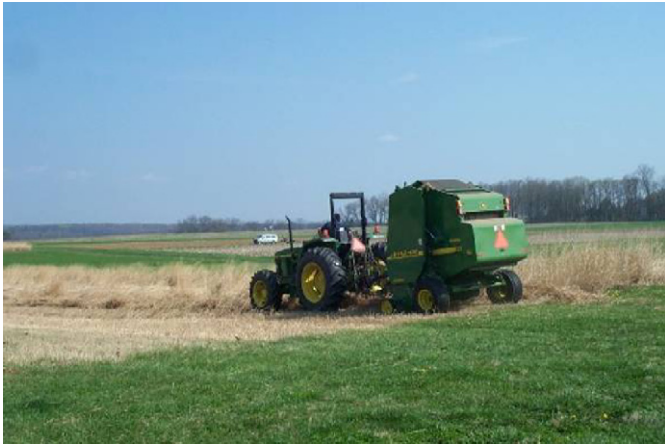
Fig. 1. Class 2 tractor baling hay.