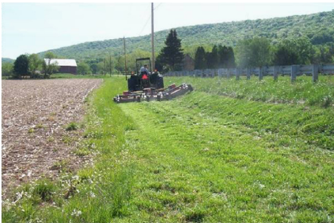
Fig. 2. Class 2 tractor mowing a field.

pad accelerometer featured a frequency range of 0.5 Hz to 1 kHz and a charge sensitivity ranging from 97.4 to 105 mV/g for the three directional axes. The frame accelerometer was secured with magnetic mounts to the floor of the operator's compartment near the base of the seat (frame measurement). The seat pad was secured to the seat with duct tape and directly sat upon by the equipment operator (seat measurement). Vibration data were generally collected for about 30 min and were used to quantify the vibration energy transmitted to the seat through the workstation platform from the vehicle chassis or frame.