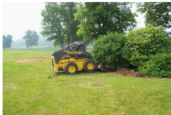
Fig. 6. Skid-steer loader during shrub removal operation.

The field data analysis showed vehicle operators experienced peak vertical accelerations—indicative of jars/jolts—that could reach accelerations as high as 3.4g 's. This particular event occurred at the transition of two road surfaces with the vehicle traveling at a relatively higher rate of speed. A power spectral density analysis of the data reveals that this g -level corresponded to a frequency lower than the sensitivity range of the seated human body (4–8 Hz). Potentially, this magnitude could be problematic, but it is unclear to what degree that it would be. How often such events occur for the type and class of vehicle is important to note when evaluating operator exposure, severity of exposure, and needed isolation for the seat and possibly other operator cab components. The authors observed that these occurrences were not frequent during data collection. However, owing to the complexities