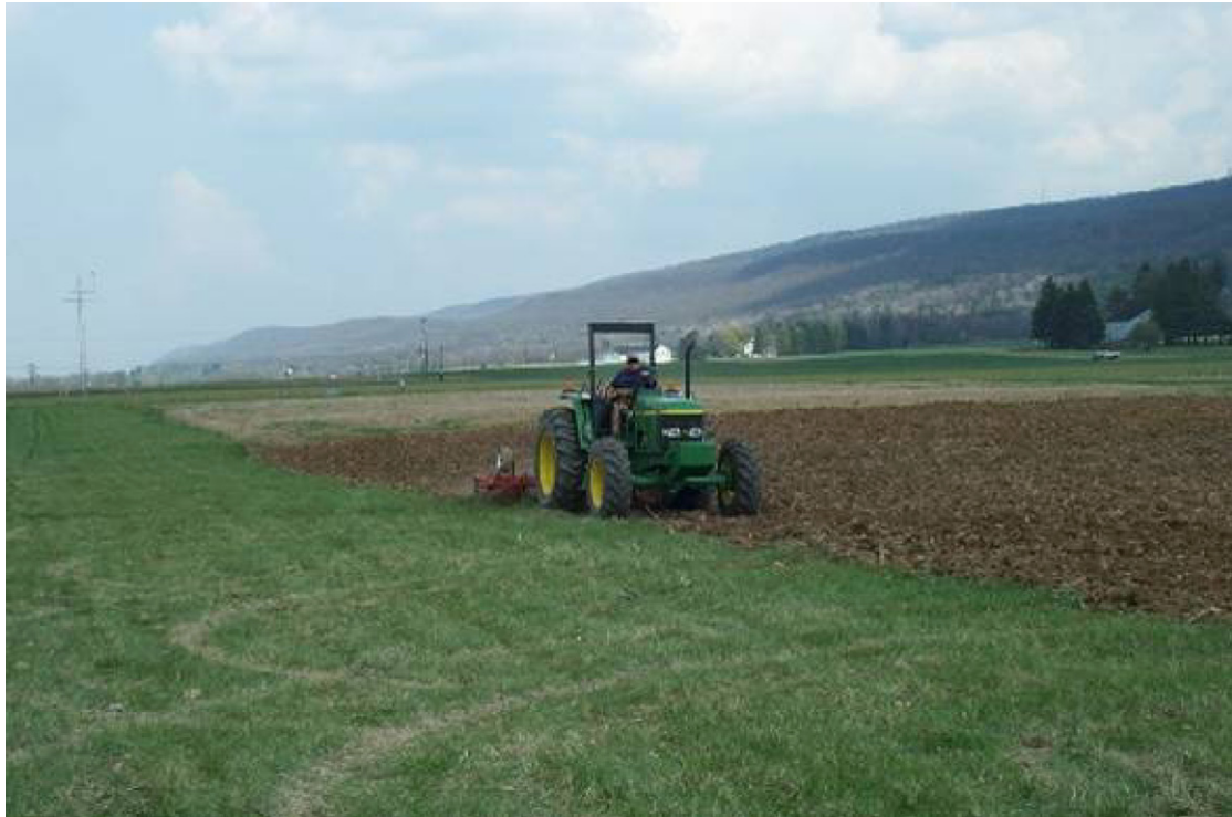
Fig. 3. Class 2 tractor tilling a field.