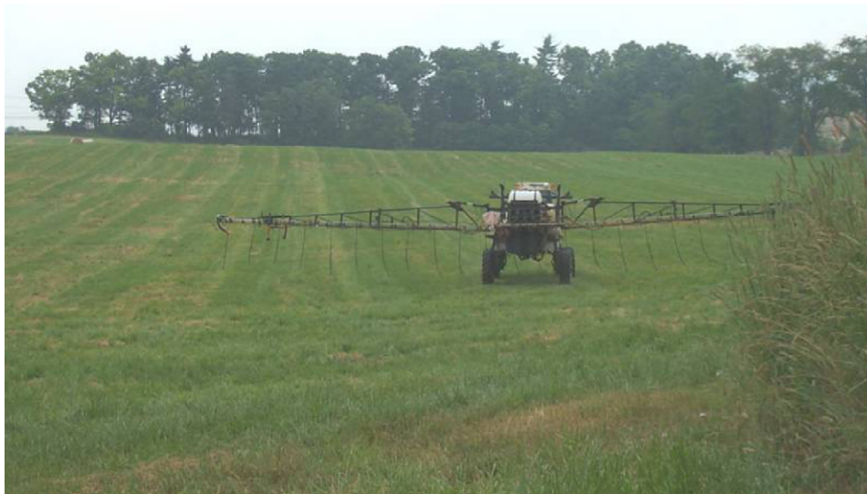
Fig. 4. Sprayer working a field.

that the seat was adjustable and 48 (96%) could easily reach and operate the pedals and levers. Moreover, 96% reported that they have to bend or twist their necks. All operators indicated that proper maintenance was performed and that repairs were performed when needed/required.