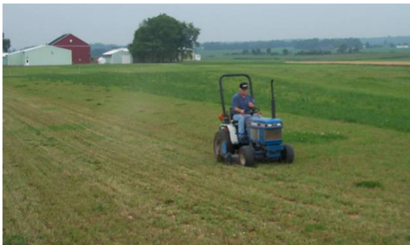
Fig. 7. Class 1 utility tractor mowing a field.