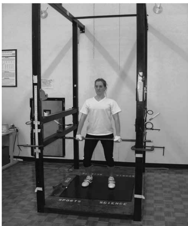
Figure 1 — Isometric mid-thigh clean pull testing. Top: schematic isometric mid-thigh clean pulls. Bottom: Photographic representation of isometric mid-thigh clean pulls.