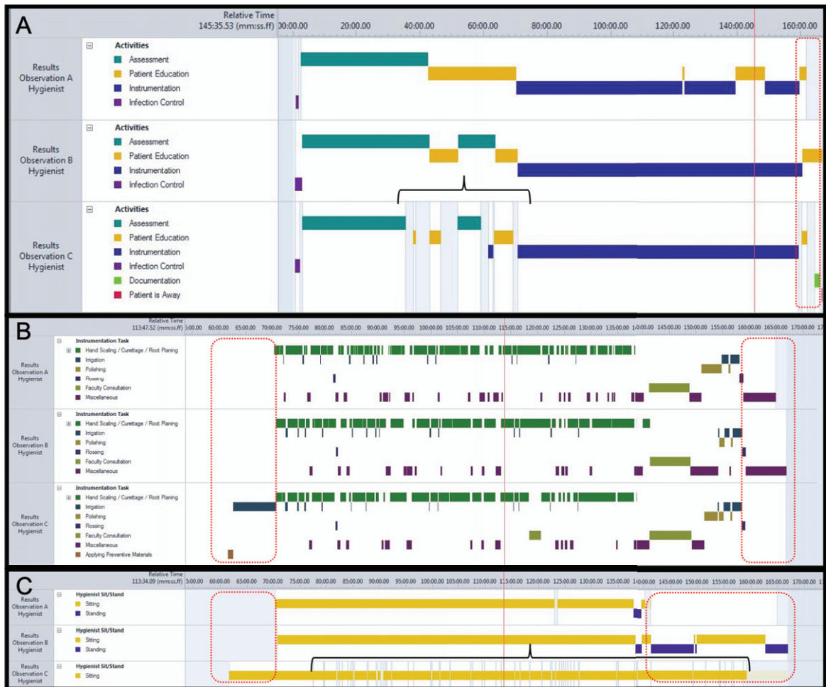
Fig. 3. Sample visualizations from Round 1 of observational coding for activities (A), tasks (B), and sitting/standing (C) used to identify significant error and discrepancies in the coding process across the three raters, such as start/end (dashed circles) and intermittent periods of no-codes (brackets).

hand scaling or ultrasonic scaling tasks to code patient head position and area of the mouth. Following each phase, raters used data visualizations within the software to ensure variables had been continuously coded throughout the required periods.