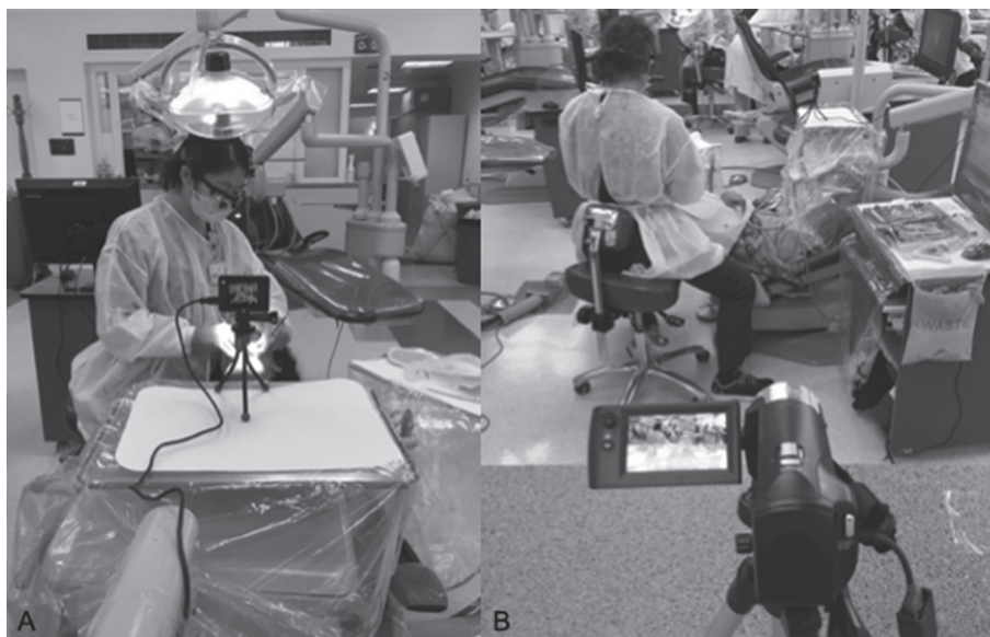
Fig. 1. Initial camera set-up using two orthogonal views.

the patient (i.e., 7:00 through 5:00); (5) patient's head rotation as left, right, or center; (6) area of the mouth being addressed.