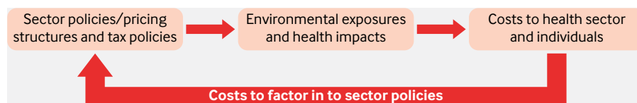
Fig 2 | Cost transfer from various sector policies to the health sector and individuals

Acting on environmental risks can reduce health inequity, as women and the poor are disproportionately affected. Women and children are more exposed to harmful smoke caused by cooking, heating, and lighting with unclean fuels and inefficient technologies. Environmental risks to health can to some extent be influenced through personal choices (vegan diet, transport choice) but are likely to be more affected by policy measures (incentivising clean technologies, carbon and fuel taxation) necessary to deliver on the Paris Agreement on climate change. Implementing wide