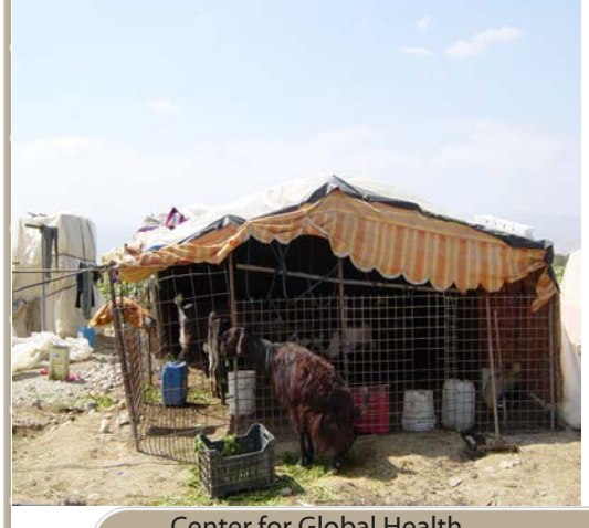
Center for Global Health

The early work of FETP residents analyzing mortality data and collaboration with many partners led to the design and implementation of a new mortality reporting system. The MoH, with CDC support, worked with Jordan's parliament to change the death reporting law, designed new mortality forms in compliance with international standards, and trained relevant staff on the forms and appropriate coding techniques. The new system began collecting and analyzing data in 2003 and determined the three leading causes of death to be ischemic health disease, malignant neoplasms, and cerebrovascular diseases. The reporting system is fully sustained by the MoH and is led by an FETP graduate.