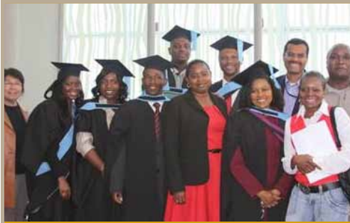
Seven SA-FELTP residents completed their training and were awarded MPH degrees at the September 2012 graduation ceremony held at the University of Pretoria in South Africa.