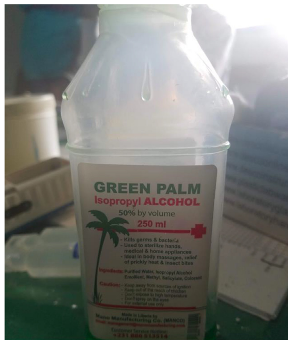
Fig 1. Isopropyl alcohol.

There is some evidence that PPE in Liberia, at times, is overused. One participant, who worked at a private facility in Nimba county, was observed advising her student to “double glove” when examining the intact skin of a patient’s abdomen. Another nurse stated that she should have worn an apron when she was handling a urine specimen, which is not indicated in Liberia’s national IPC guidelines. Last, a sign at a private facility indicated that nurses often wore gloves when documenting or taking patients’ blood pressure by discouraging the practice (See Fig 2).