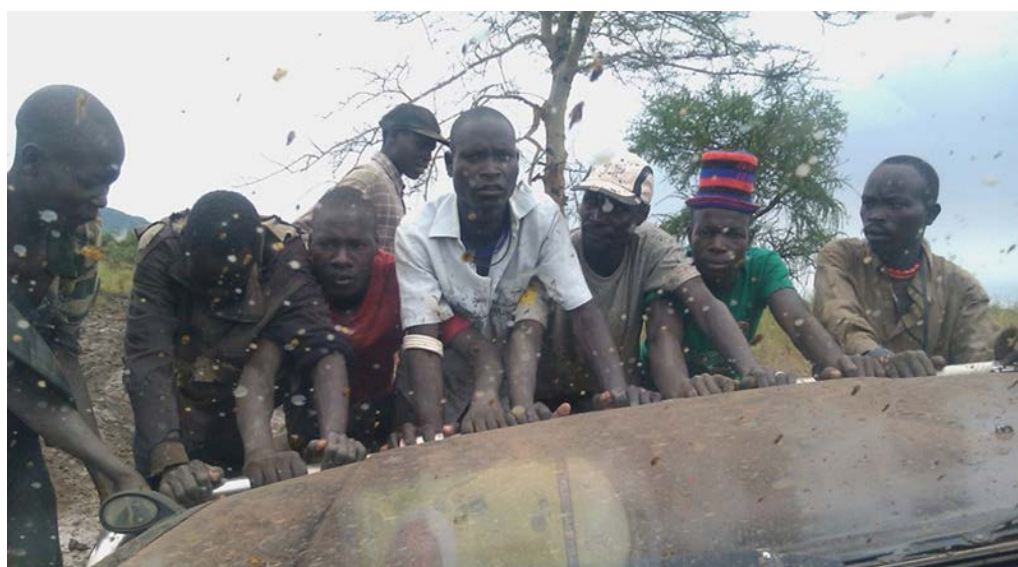
Figure 1. Field data collection teams faced transportation challenges. (Field teams were assisted by helpful local people in bad weather and bad road conditions.)

Makerere requested bids from several companies to provide drivers and vehicles for the six teams. We selected two companies, assigning three teams to each. Our team personnel were required to pay for petrol along the way, providing another accounting and cash flow challenge. In one region, it was necessary to hire security personnel from the Ugandan police force to accompany data collectors. Heavy rains made roads slippery, mud was deep, and some roads were washed out (see Figure 1).