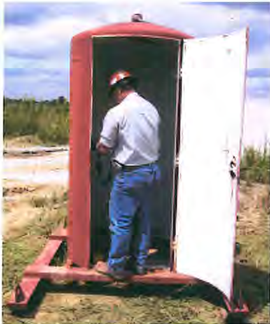
Figure 3. Blasting shelter at a surface limestone mine in Ohio.

Light buildings, pickup trucks, and other vehicles which are often used as covers, have been penetrated by flyrock [Schneider, 1996]. During a coal mine blast, a blaster positioned himself under a Ford 9000, 21/2-ton truck, and fired the shot. A piece of flyrock traveled about 750 ft and fatally injured the blaster under the truck [MSHA, 1992]. This accident could have been prevented by using an adequate blasting shelter. A safe location and sufficient cover is critical to a blaster's protection if the firing lines are not long enough to be beyond the flyrock range [Schneider, 1996]. Some blasting operations use a remote controlled firing system to permit blasters to stay out of the blast area.