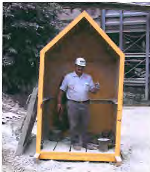
Figure 2. Blasting shelter used at a surface limestone mine in southwestern United States.

Figure 2 shows a blasting shelter used at a surface limestone mine in Southwestern USA. The shelter was constructed by the mine's personnel. Another example of a blasting shelter used at a surface limestone mine in Ohio is shown in Figure 3 . The mining company requires that this type of blasting shelter be used for protection from a blast. The blast shelter is mounted on skids for ease of transportation and is constructed of steel that is 3/8-inch thick. The use of specially designed blasting shelters can provide the protection needed to prevent a person from being struck by flyrock. In the international sphere, a more sophisticated blast shelter has been designed by two Queensland, Australian inventors [Queensland Government Mining Journal, May 2001]. The shelter, which is cylindrical and constructed of 5/8-inch thick steel, is mounted on a rubber tired trailer.