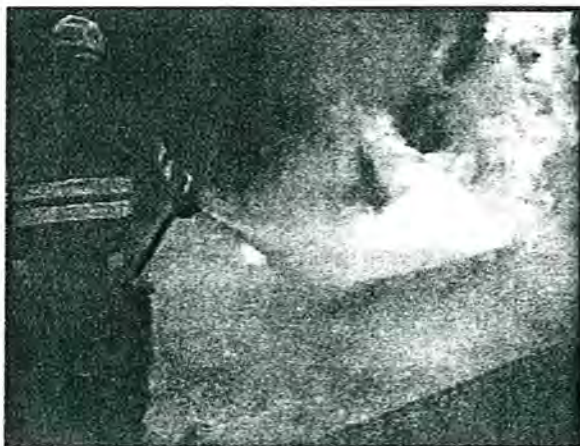
Figure 2. Extinguishment of a liquid fuel fire with dry chemical.

The average cost of materials (chemical powder, gas cartridges, fuel) and wages for fire extinguisher training could range from $65 to $100 per person. An inexpensive mortar box (shown in Figure 2) filled with several inches of water, and a mixture of diesel fuel and gasoline, is suitable for training in the use of fire extinguishers (9.1-kg), fire hoses, hand-held