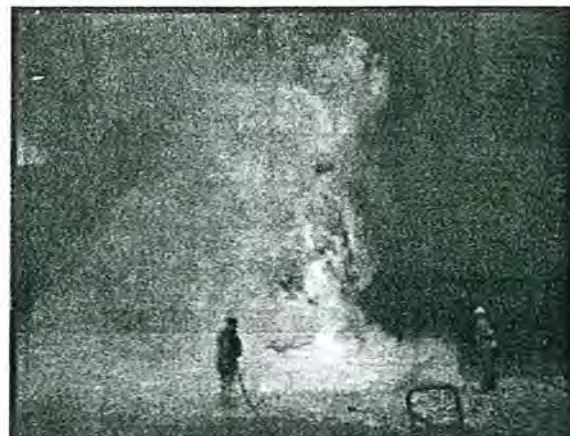
Figure 3. Extinguishing a 37.2 m 2 liquid fuel fire.

where two miners with larger (68-kg) fire extinguishers are required to fight the fire.