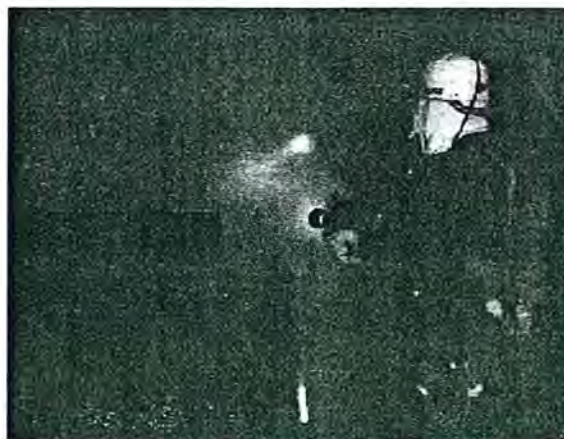
Figure 1. Rescue team member fighting a conveyor belt fire.

Lake Lynn Laboratory (LLL) and operating mines (13). Figure 1 shows rescue team members fighting a conveyor belt fire in the surface fire gallery at LLL. This training resulted in improved technology and training for mine rescue teams, fire brigades, first responders, and miners in general. For example, existing technologies were identified to help responders during exploration and recovery operations. These included various chemical light shapes, strobe lights, light vests, and laser pointers to identify team members. Most of these devices may be used to mark underground areas and certain mine materials. Strobe lights were used for mapping out escapeways and lasers were used to negotiate travel through smoke. Thermal imaging systems allow rescue personnel to see in darkness and heated areas. These efforts have also resulted in improved disaster recovery training drills and the development of new technology, such as new team lifelines, and inflatable devices for fire suppression and personnel escape. These technological advancements have improved the state of