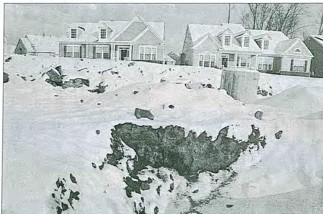
Figure 2 - The first of four pits dug at the location of the trench blast in an effort to vent CO. Homes 1 and 2 can be seen in the background.