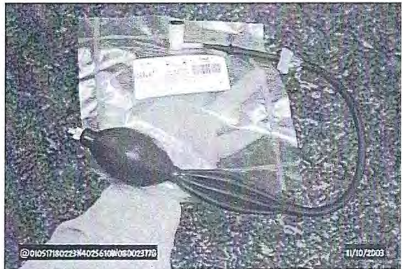
Figure 4. Aspirator pump and Tedlar bag