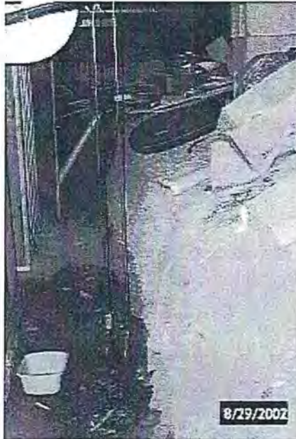
Figure 3. Rock ledge entry points.

Detector tubes will provide only field quality sample results and are not recommended for detailed investigations where quantitative data are required. Detector tubes must be selected for each particular gas to be tested, often requiring trial and error sampling.