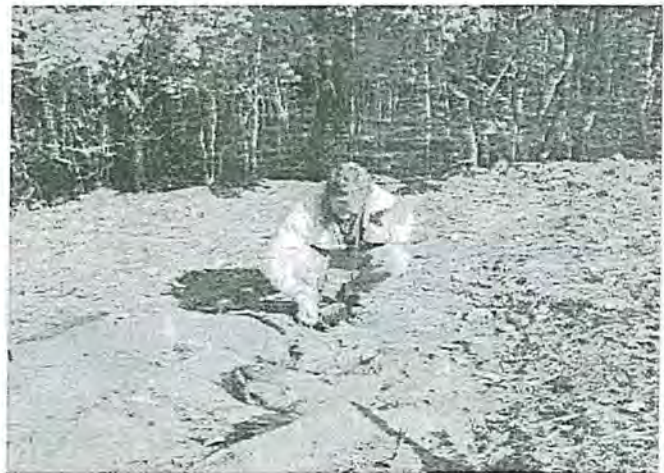
Figure 2. Borehole monitoring with sampling wand