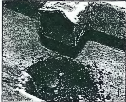
Fig. 1. The cut end of a filled plow frame section (4x4x142 in.) and the contained metal scrap.

NIOSH, the U.S. government agency charged with conducting research aimed at preventing work-related injury and illness, investigated two such incidents that occurred