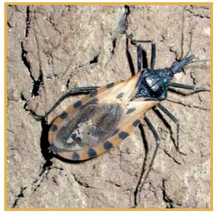
Photo of a triatomine bug which if infected can transmit T. cruzi .

CDC provides extensive support to physicians and patients nationwide, including education about the disease, patient risk factors for infection, diagnostic testing, recommendations for appropriate evaluation and treatment, and the release of medication. Treatment for Chagas disease is available. In the United States, antiparasitic drugs are available only from CDC for use under investigational protocols for compassionate treatment. CDC has released medication for treatment of more than 350 patients since 2000, the majority of those drug releases in the past six years. This recent, substantial increase in requests for treatment may reflect growing recognition and increasing frequency of testing for Chagas disease in the United States.