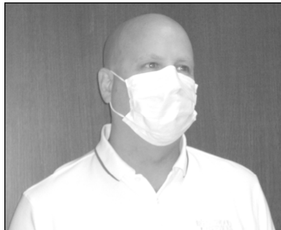
Figure 5.3 Patient wearing a surgical mask. This mask is designed to stop droplet nuclei from being spread (exhaled) by the patient.