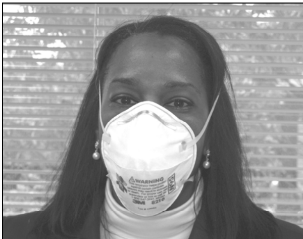
Figure 5.2 Health care worker wearing a personal respirator.