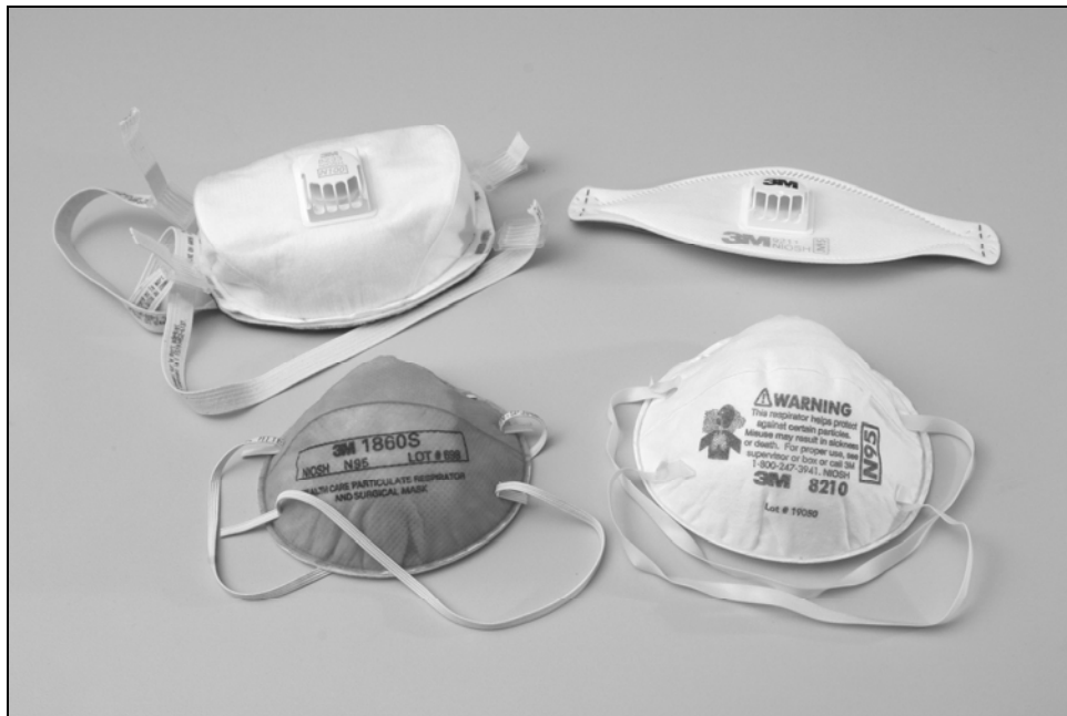
Figure 5.1 The personal respirators in this photograph are specially designed to filter out droplet nuclei.