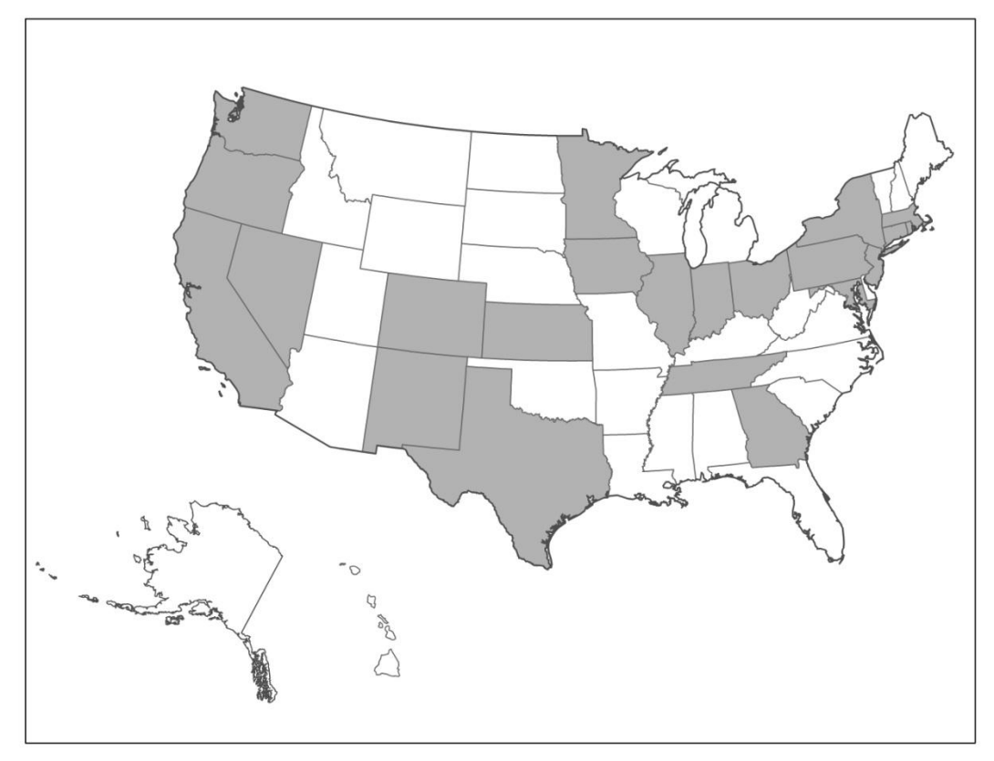
Figure 1. States reporting at least one case of listeriosis to the Listeria Initiative, 2007 (n=22)*.