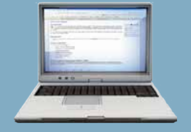
Table of contents Podcasts Ahead of Print CME Specialized topics

Sign up to receive emailed announcements when new podcasts or articles on topics you select are posted on our website.