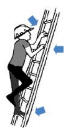
Three-point ladder safety rule

Youth less than 16 years of age were involved in 75% of youth injuries on Hispanic-operated farms.