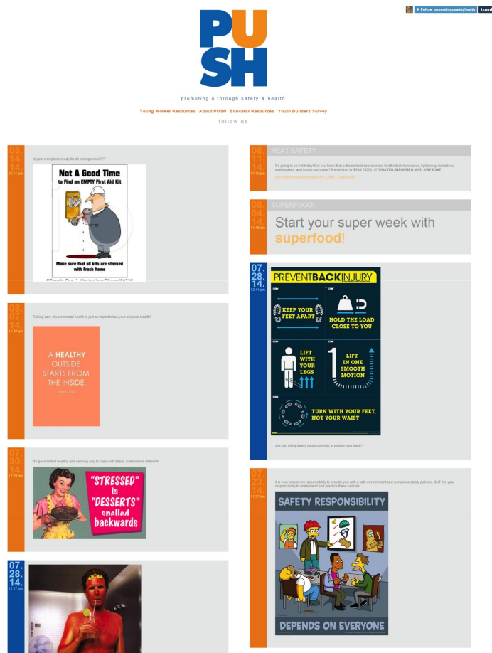
Figure 1. PUSH Tumblr site with different activities, one of which would be highlighted for assessment each week.

Once chosen, activities were embedded on the PUSH project's Tumblr page (Figures 1 and 2). Beneath the activity were open survey items powered by Survey Gizmo, an online survey hosting website. The activity was followed by instructions that survey items were for parks and recreation workers and should only be completed once per individual. The two survey questions were (1) I enjoyed the activity, (2) I learned something new. Both questions were rated on a seven-point agreement scale, from 1 = strongly disagree to 7 = strongly agree. Other than their assigned pool, responses were anonymous.