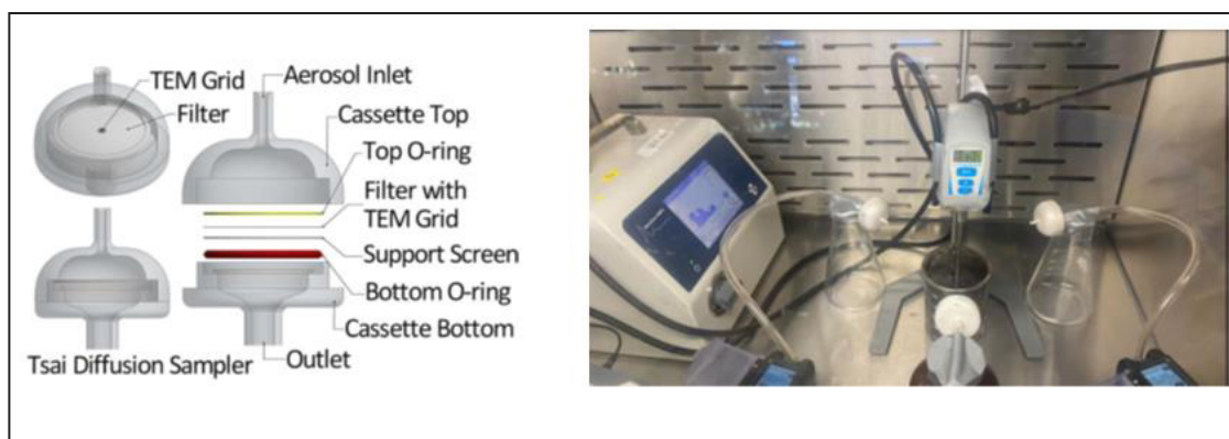
Figure 1. The Tsai diffusion sampler components (left) and the experimental test setup used to test the Tsai diffusion sampler (right)