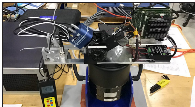
Figure 6. The prototype of the QCL test system for real-time measurements of respirable silica dust.

a promising technology: a quantum cascade laser (QCL). The QCL is a source of IR light that enables the generation and detection of RCS features in IR spectra. This work developed and tested hardware and a measurement system that could be developed into a wearable configuration to measure respirable silica dust during a miner's working shifts. The performance of QCL technology as it relates to a potentially field-deployable, wearable, near real-time silica measurement system that supports OSHA and MSHA silica standards was determined. The weight of the developed test system was 6.5 pounds and measured 17"× 4"× 6" in size (408 cubic inches) (Figure 6). This weight and volume do not include either a battery or main power supply. The work conducted during this contract has demonstrated that microgram levels of RCS can be measured utilizing this detection technique. The presence of coal dust does degrade detection as compared to RCS alone and therefore, further research is required to improve the performance.