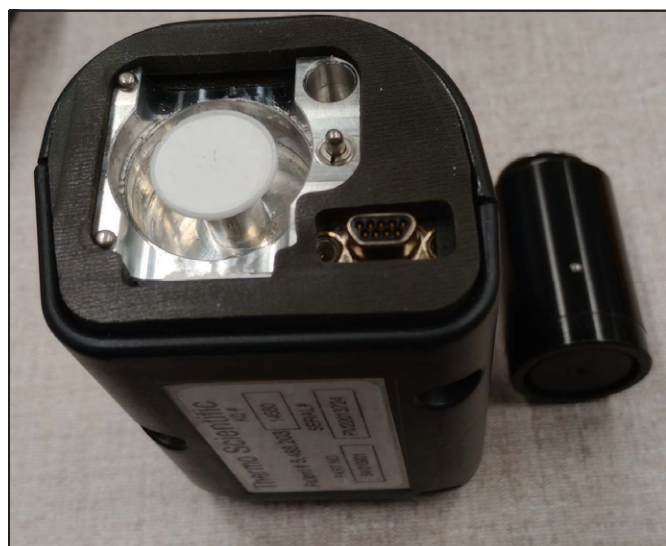
Figure 5. The new PVC filter for silica analysis shown attached to the CPDM transducer where the respirable dust sample is collected

Thermo Fisher researchers reviewed real-time monitoring of RCS that may be enabled through the development of