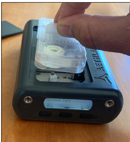
Figure 3. An AethLabs MA200 personal real-time Black Carbon/Elemental Carbon monitor

FTIR for quantification of RCS lab-generated and field-collected samples is underway.